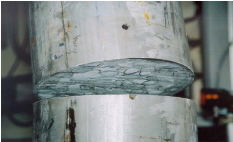
Fig. 3. Mock-up piece showing cutting surface created by epoxy-foam -injection

To maximize ALARA-related benefits associated with stabilizing the internal equipment surfaces via sealant injection, removal activities involving in-cell cutting were coordinated with the progressive removal of piping and structural supports. This allowed personnel to consolidate activities so multiple removal tasks could be performed by making a single entry. Beginning at the uppermost platform level and working downward using the Spider Basket® to traverse the cell, taking this approach gave personnel the opportunity to do more work in less time, thus limiting the amount of fatigue experienced while conducting dismantlement work from in-cell platforms and scaffolding while wearing full-suit-ups.