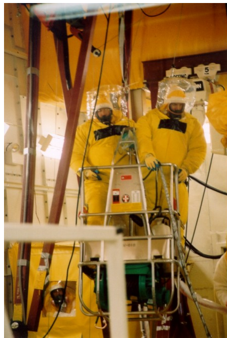
Fig. 2. Preparing to enter XC-2 in the the Spider® Basket

Training to prepare personnel for making entries into XC-2 included an extensive review of radiological and safety concerns associated with wearing Bubblesuits. Additionally, personnel received training in the safe operation of a Spider® Basket. After confirming that personnel were qualified to operate a Spider® Basket, the actual device to be used was set-up in an open area of the XCR. Here work crews practiced getting into or out of the Spider® Basket wearing a full suit-up. These supplemental practice sessions gave work crews the opportunity to refine techniques for using the Spider® Basket before making the first entry into XC-2 from the XCR. (A view of a work crew in full suit-up preparing to make an entry in the Spider® Basket is shown in Figure 2.)