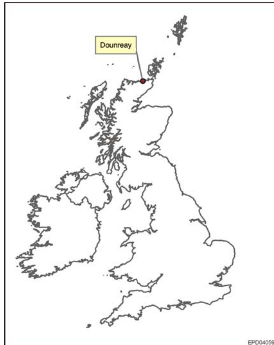
Fig. 1. Location of Dounreay

Construction of Dounreay started in 1955, with the objective of investigating the feasibility of fast reactors for power generation. By 1960 two reactors had been built and had achieved criticality: Dounreay Materials Testing Reactor (DMTR) was a low power uranium metal fuelled thermal reactor for experiments into material properties, and Dounreay Fast Reactor (DFR) was a uranium metal fuelled fast reactor with NaK coolant, rated at 60 MW thermal. Fuel elements for both reactors were fabricated and re-processed at Dounreay.