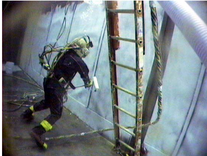
Fig. 3. Applying fixative to the wall of the MTR canal.

After the epoxy fixative coating passed inspection, water was removed from all four basins. The fixative minimized the risk of airborne contamination by trapping residual contamination on the basin walls. This allowed the pool deactivation goals to be safely met and marked another milestone in closing facilities at the INL which are no longer needed to help ensure US civilian and energy safety.