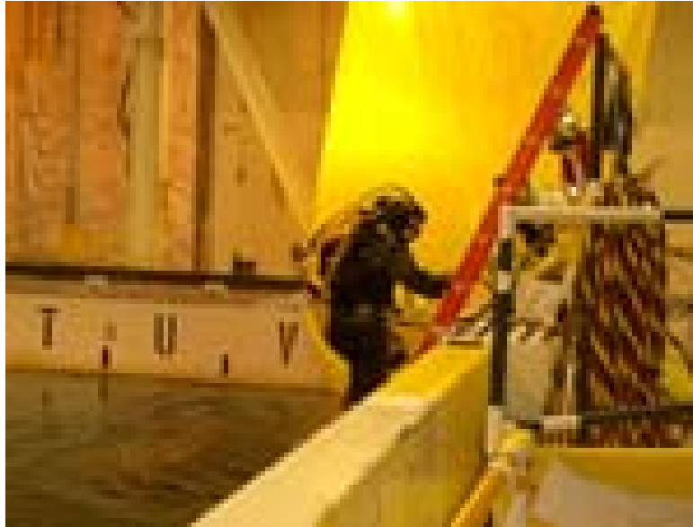
Fig. 2. Diver enters basin at Test Area North.

S. G. Pinney commercial divers were chosen to complete this work. Before beginning dive activities, all areas to be worked on were surveyed by the divers themselves. The potential for finding unexpected debris items during cleanup of the basins was anticipated. The dive master was in constant voice and video contact with the divers during dive operations. Divers were instructed not to pick up anything before scanning it. There were no instances in which a diver entered an unsurveyed area or picked up objects that had not been surveyed. They first scrubbed the loose contamination off the basin walls and floors using a ship hull scrubber and vacuumed up the sludge. They then applied the UT-15 coating using a two-hose power roller system, which mixed the epoxy at the roller head, and eliminated the pot life concerns.