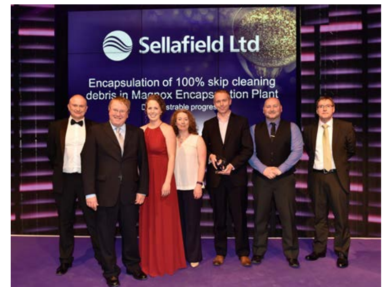
RWM and Sellafield Ltd staff award for the successful delivery of the 100% RSWD project. Enabling an increase in throughput for wastes arising as a result of fuel reprocessing at Sellafield