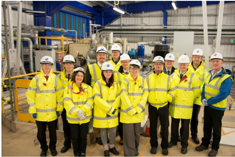
Supporting commissioning of the treatment route for Pile Fuel Storage Pond legacy sludges through expansion of the WEP processing envelope