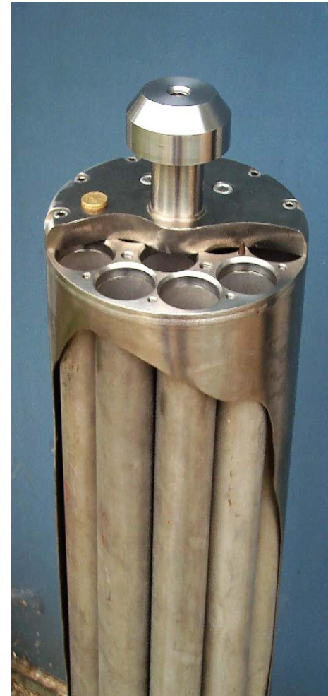
Disposability assessment of DRAGON fuel waste to be processed at the Magnox Encapsulation Plant