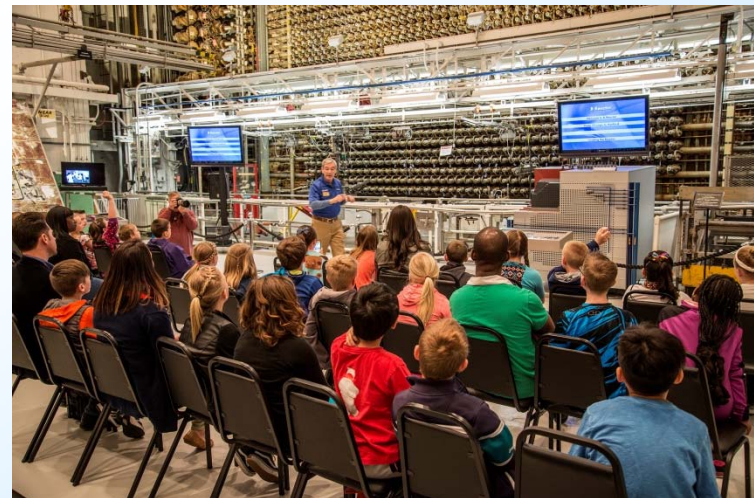
School tour at B Reactor