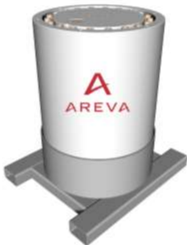
Fig. 3. TN ® MW cask in storage configuration positioned on its forklift frame