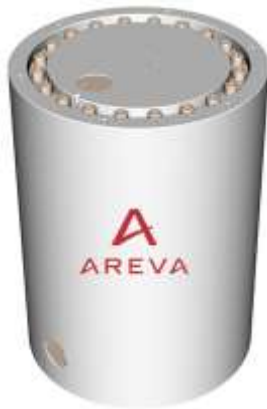
Fig. 1. TN ® MW cask in storage configuration

An overview of the TN ® MW cask is provided in the following figures: