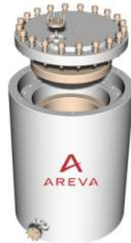
Fig. 4. Stripped down view of the TN ® MW cask equipped with additional internal shielding