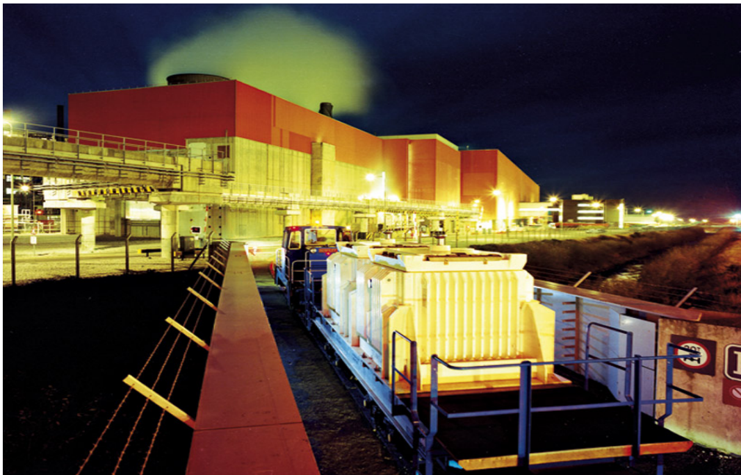
Fig. 1. The Fuel Handling Plant at Sellafield Receives Spent Nuclear Fuel from Magnox and AGR Power Stations across the UK, Supporting Clean-Up Operations

Sellafield Ltd is government funded, as such there is always a need to drive the facilities and the programmes to undertake work more efficiently and deliver earlier. As there is only a finite amount of fuel left to be reprocessed, it means there is a finite number of days left of reprocessing. Any increase in throughput will lead to a reduction in the number of days of reprocessing left. Every day that the reprocessing programme finishes earlier is a significant cost saving to the UK government.