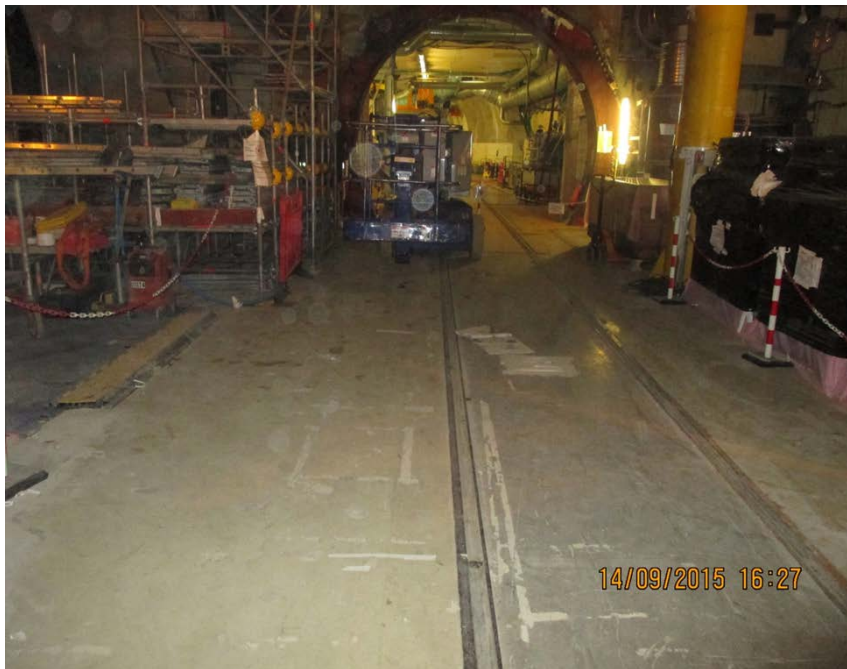
Fig.5. Enlargement of reactor cave entrance

In Chooz A, the entrance to the reactor cave has been enlarged to allow access to some heavy equipment, like the future reactor vessel stand that will be sealing the reactor pit after removal of the vessel (see Fig.5.). Other significant civil work modifications occurred for allowing the installation of a hot cell for the future drying and characterization of the cut internals and final container loading. To achieve that, a previous steam generator pit has been sealed with a concrete slab to create the necessary space for installing the hot cell. Another steam generator pit has been also sealed for installing the future dry cutting workshop. Other significant works had to be performed for bringing new electrical cabinets and installing new ventilation ducts.