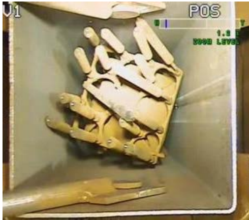
Fig. 6. Flow diffuser in spent fuel rack

At José Cabrera, before installing the new working bridge, the spent fuel racks had to be removed from the spent fuel pool. However, some operational waste was still stored in rack cells and needed to be segmented and packaged first. A number of operational waste such as RCCA's, primary sources, secondary sources were cut with shearing tools and positioned into special designed canisters that was later put into the Multi-Purpose Canisters along with the other high activated waste. Fig.6 shows an example of the type of operational waste retrieved from the spent fuel racks.