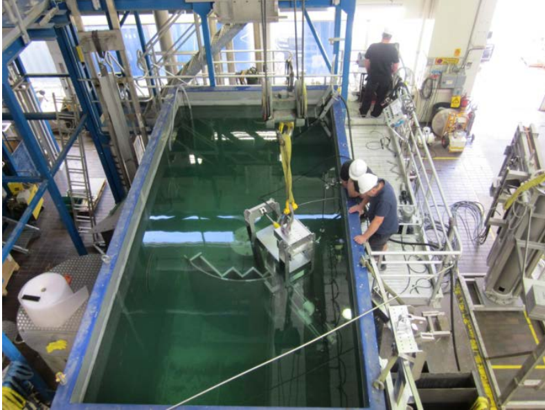
Fig. 7. Qualification in Västerås