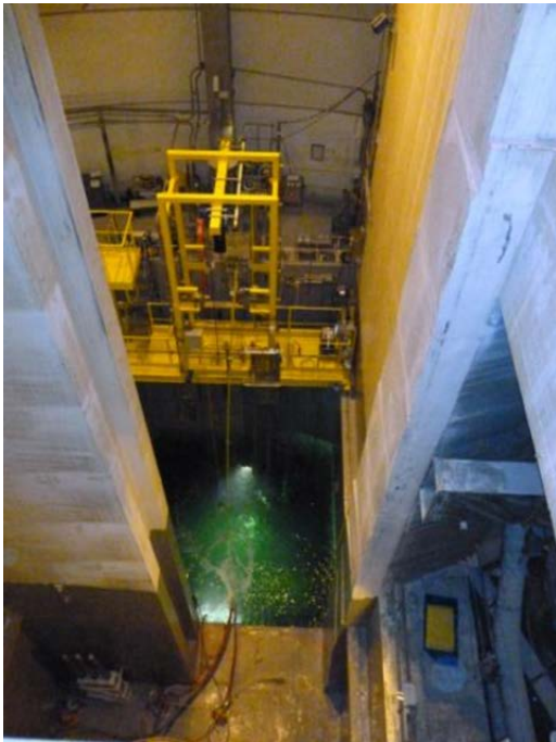
Fig.3. Demolition of the spent fuel pool separation wall

facilitating the transfer of the vessel in one piece to the spent fuel pool area. Fig.3 shows the new connection created between the spent fuel pool and the reactor cavity.