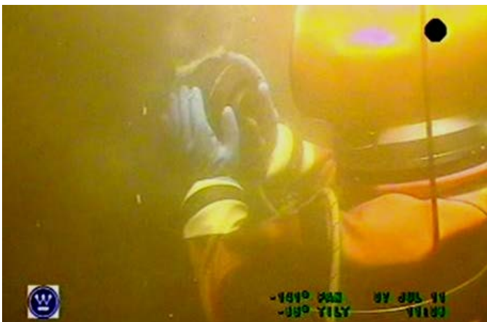
Fig. 1. Diver performing leak tightening

The sealing of the pool walls was a challenging task as the initial leakage was substantial and coming from all over the pool area. The floor of the reactor pool was therefore reinforced with a 15 cm thick concrete layer whereas leakages in the wall were sealed by injecting sealant into all identified cavities and the whole surface was then painted with an impermeable paint. The leakages in the spent fuel pool steel liner had to be sealed under water because highly irradiated operational waste was stored in that pool which prevented draining of it. This operation was performed using divers as indicated on Fig.4.