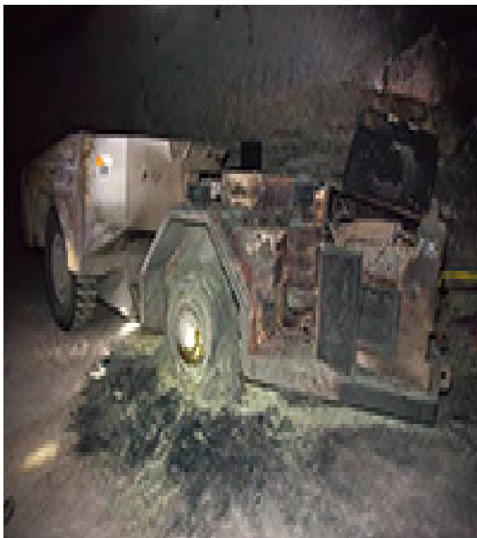
Salt Truck Fire in WIPP Underground