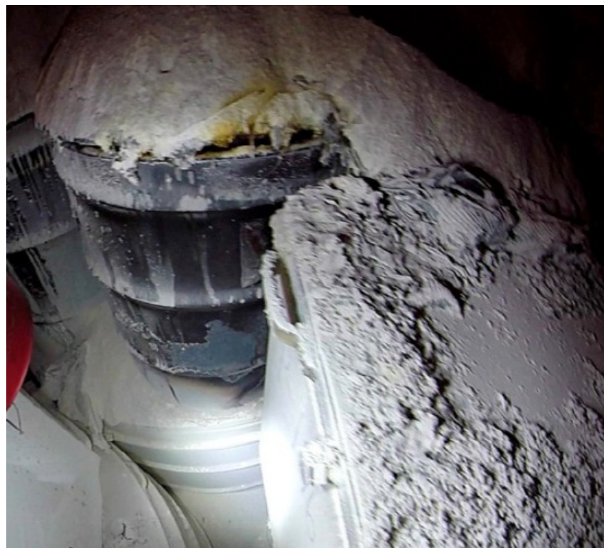
Breached Drum in WIPP Underground