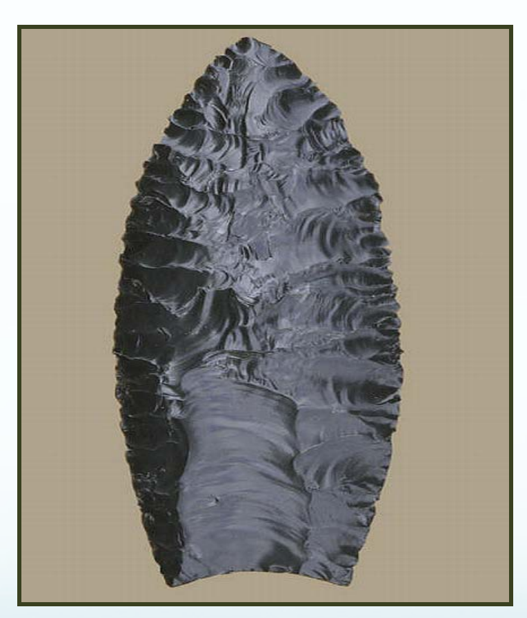
More Than 10,000 years ago...