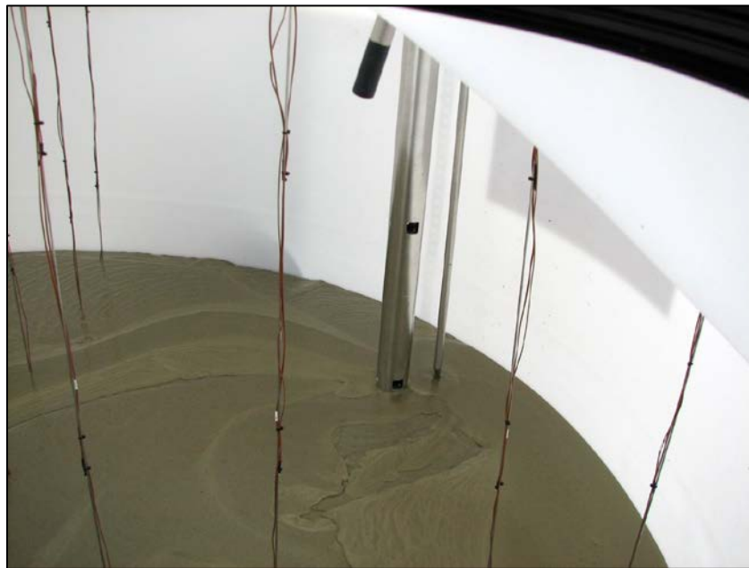
Fig. 2. Surface of the grout at the conclusion of the first lift. Note the opening for the emplaced core sampler.

The second lift was performed the following day using similar operating parameters as the initial lift: 270 kg/h and 3.5L/m, for a targeted W/DM of 0.63. The uncertainty of the salt solution flow meter lead to variability in the W/DM calculation. This in turn decreased the precision in the control of the salt solution feed rate and the resulting W/DM. These conditions resulted in a calculated grout density of 1.69 \text{ g/cm}^3 and a grout processing rate of 5.3 L/m into the container. Small adjustments were made to the salt solution flow to maintain a stable W/DM. The SCPF produced grout for approximately 6.1 h resulting in ~36 cm of grout added to the container. The average salt solution flow rate for the second day of processing was 3.4 L/m and the average grout processing rate was 5.2 L/m. During processing, a film of excess salt solution was observed on the surface of the pour. The salt solution flow rate was subsequently reduced to 3.4 L/m – the flow rate used during the first lift. All of the excess salt solution had been incorporated into the grout slurry prior to the completion of the lift.