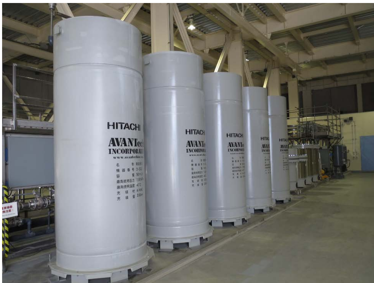
HI-G Adsorption Vessels

The system is designed to handle the influent water characteristic identified in the table below. The anticipated effluent is also detailed in the table below.