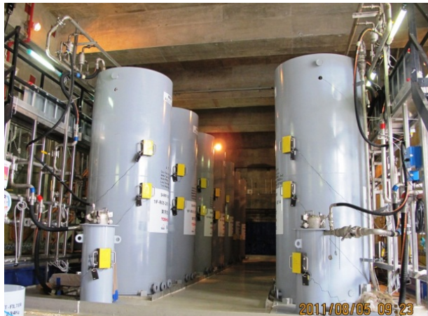
SARRY I: Cesium Removal System

Hitachi and Avantech provided critical equipment during the site stabilization phase. Specifically, Hitachi provided the reverse osmosis and evaporation equipment while Avantech provided the cesium removal system identified as SARRY. These systems have been well documented and it's not the intent of this paper to further elaborate. However, it is important to note that these systems continue to operate in their original configuration and provide the support to the site necessary for reactor maintenance. Currently these systems have processed over 794,000 cubic meters (210 million gallons) of water. The waste generation has been minimal generating approximately 98 vessels which are being stored at the site safely.