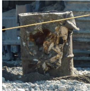
Examples of Concrete drums and debris drums