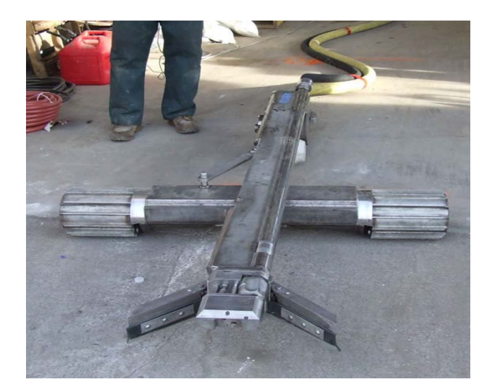
Fig. 1. Mantis Device

Hanford has also adapted a FoldTrack device, originally used for cleaning sludges in oil tankers and conveyance equipment, for use inside of unobstructed tanks. Similar in concept to the Mantis, the FoldTrack mechanically breaks up chunks of waste, moving solids to the pump inlet. The apparatus can collapse, i.e. fold to fit through tank risers. The Foldtrack has nozzles to spray high-pressure water directly at the waste.