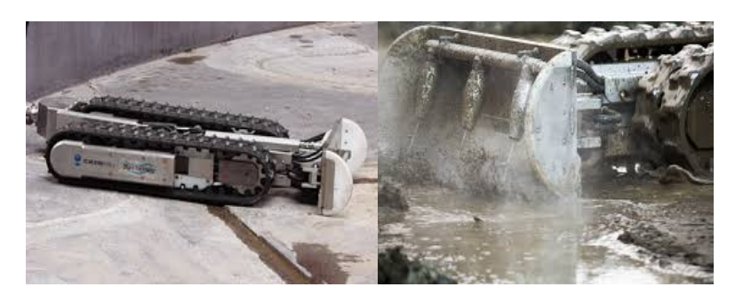
Fig. 2 FoldTrack

Hanford has also adapted a FoldTrack device, originally used for cleaning sludges in oil tankers and conveyance equipment, for use inside of unobstructed tanks. Similar in concept to the Mantis, the FoldTrack mechanically breaks up chunks of waste, moving solids to the pump inlet. The apparatus can collapse, i.e. fold to fit through tank risers. The Foldtrack has nozzles to spray high-pressure water directly at the waste.