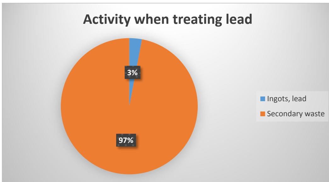
Fig. 1. Typical activity distribution when treating lead at Studsvik.

From Figure 2 it can be seen that the secondary waste is only 1% of the total weight which means that all the mass remains as metal and can be subject to recycling after conditional clearance. The effectiveness of the decontamination can also be seen from Figure 3, which shows the specific activity in the ingots and in the secondary waste. It differs with more than three orders of magnitude in specific activity.