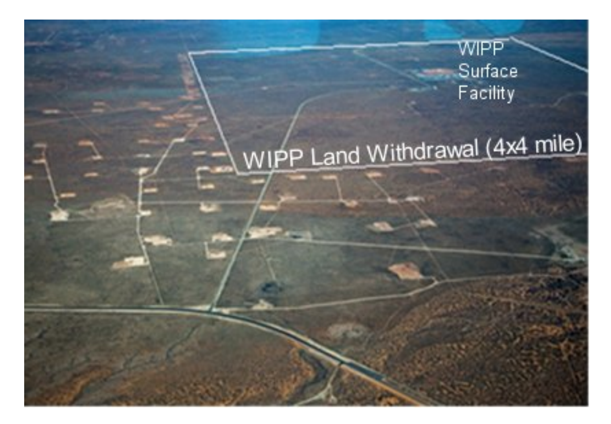
Figure 2. WIPP facilities location within the Land Withdrawal Area