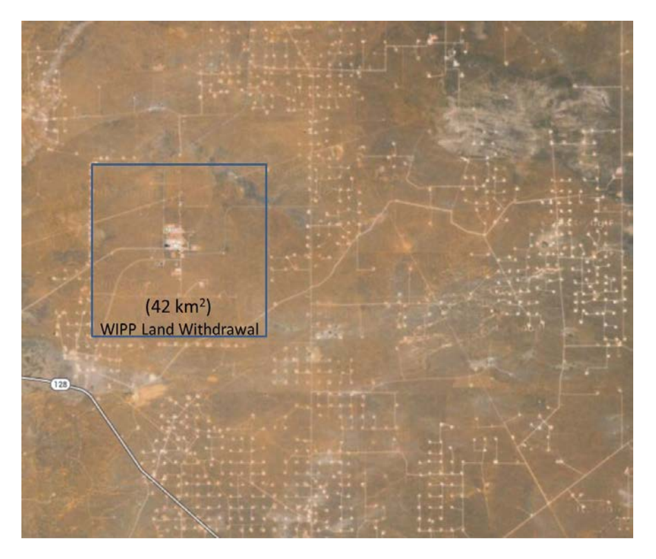
Figure 1. Well Pads in the Portion of the Permian Basin near the WIPP Site

The Land Withdrawal Act boundary is again outlined in a closer-in photo in Figure 2 and shows it surrounded on several sides by well pads. This suggests the site is likely to be of commercial development interest. An industry report cited in a report by the Environmental Evaluation Group suggests there is substantial oil and gas beneath the WIPP site [6].