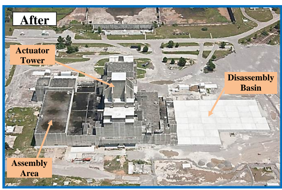
Figure 2. Pre and Post Decommissioning