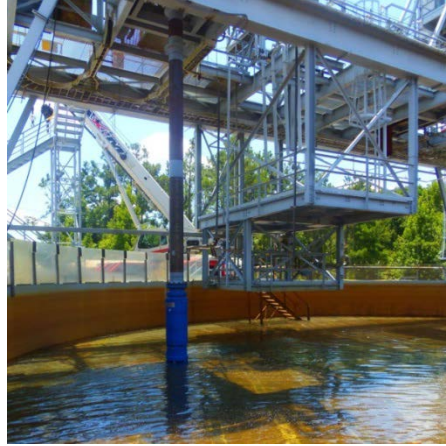
Fig. 9. CSMP installed in the TNX test tank

An example operational data graph and table below shows the run data during a ramp up/down, integral speed step, and continuous run in water over 9+ hours. Useful trends that can be pulled from these graphs are: