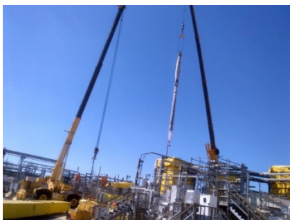
Fig. 6. Pump sleeved and clear of riser