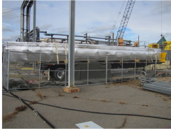
Fig. 8. SMP in long term cold weather storage

for another 6 years at a minimum, but these pumps required removal to provide tank access during the grouting phase. To date, no SLP has been required to be stored outside of a waste tank after use. However, contamination and shielding controls would be similar. Also, long shafted pumps require routine shaft rotation not available within storage containers.