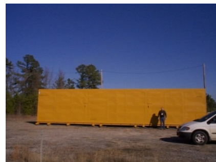
Fig. 7. SMP Pump Transport Container