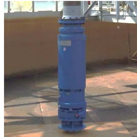
Fig. 3. CSMP

SLPs and SMPs have been developed, matured, and successfully used to perform waste removal within the Savannah River Site Tank Farms. As early as 2010, these pumps were the baseline for tank waste suspension and mixing for closure activities at SRS. SLPs have proven reliability and have the process flexibility to support most tank closure requirements. SMPs are higher capacity pumps which provide an adequate cleaning radius that requires the use of only 3 per tank versus 4 SLPs. The SMP's hydraulic design and operational requirements typically increases the tank liquid level needed for long duration mixing campaigns and are not designed to operate for long periods of time in oxalic acid or in water which has been used in some tank closure campaigns as a means of final tank cleaning. Table 1 below provides specific pump details for the SLP and SMPs.