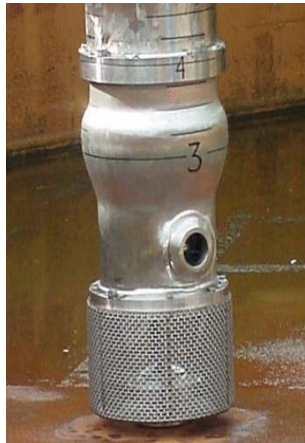
Fig. 2. SMP