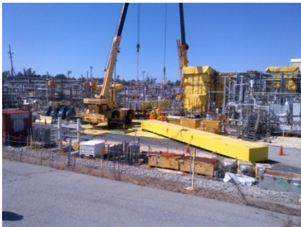
Fig. 4. Tank top hut, containment box, main and tailing crane.

Baseline planning includes relocation of mixing pumps from tank to tank as waste removal progresses through the tank farms. To date, this has only been successful between adjacent tanks where cranes can move the pumps between tanks in one lift, at a cost of $1.18M.[1] Both SLPs and SMPs have been successfully moved in one pick between adjacent tanks. General requirements include huts on each tank and pump sleeves for contamination control with critical crane lifts for pump relocation. For movement of pumps between tanks that are not adjacent, the scope and contamination controls are much greater. In addition to containment huts and pump sleeves, containment and transportation boxes are required. A second crane is also required to support pumps as they are placed on ground supports. A recent estimate to move one SLP between tank farms estimates the cost at $1.45M. For SMPs, the pump must be transported at a 5 degree slope after contamination since the vendor provided impeller locking device cannot be installed on a contaminated pump. Provided below is a summary of the scope required to relocate pumps by transportation.