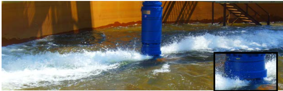
Fig. 12. Rooster Tailing during Testing at TNX

The operation of a mixing pump in a manner that results in “rooster tailing” is not allowed per the current SRS Tank Farm Documented Safety Analysis (DSA). This is to eliminate the potential to aerosolize waste during mixing in a waste tank. An evaluation was conducted to determine the levels and speeds the CSMP can run at without rooster tailing, the photo below is an example of the CSMP rooster tailing. The evaluation determined that the CSMP can run as low as 76.2 cm (30 inches) of submergence at full speed, at lower levels it should be run at 157.1 rad/sec (1500 RPM) or less, and the CSMP should not be run at all below 61.0 cm (24 inches) of submergence.