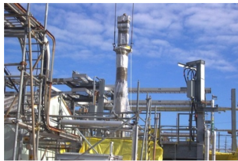
Fig. 5. Sleeving of pumps for contamination control