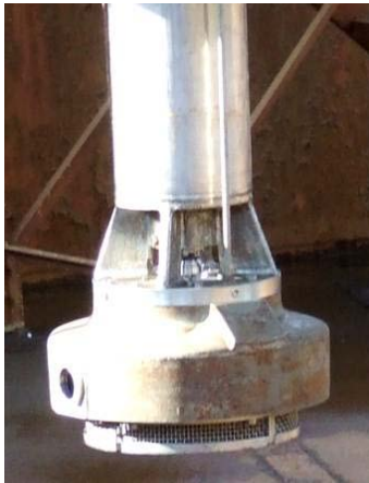
Fig. 1. SLP