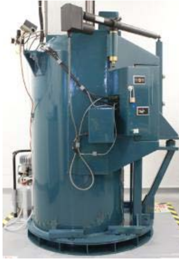
Fig. 2: Co-60 irradiator

To determine the radiation dose to an irradiated sample, ferrous sulphate (Fricke) dosimetry was selected as the most appropriate dosimetry method for this study. The dosimeter was created by adding \text{FeSO}_4 to an aerated acid matrix of \text{H}_2\text{SO}_4 and water. When \text{Fe}^{2+} is irradiated, it is oxidized to \text{Fe}^{3+} with the chemical yield G(\text{Fe}^{3+}) of 15.5. This oxidation also happens in natural light, so solutions are kept covered in aluminium foil. The absorbed dose D can be found by using Eq. 1 [18].