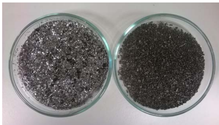
Fig. 1: Photograph of Nyex 1000 (left) and Nyex 2105 (right)

Nyex 1000 is the adsorbent grade used in the majority of recent studies by researchers working with Arvia Technology [15–17]. This material was supplied as flakes with no internal surface area. The material is non-porous and as a result has a much lower surface area than traditional carbonaceous adsorbents like activated carbon. A newer grade of adsorbent, Nyex 2105, and an intermediate grade, Nyex 2104 have also been supplied for this study. The morphology of Nyex 1000 and Nyex 2105 can be compared in Fig. 1. Nyex 2105 is more grain like and less sticky than Nyex 1000.