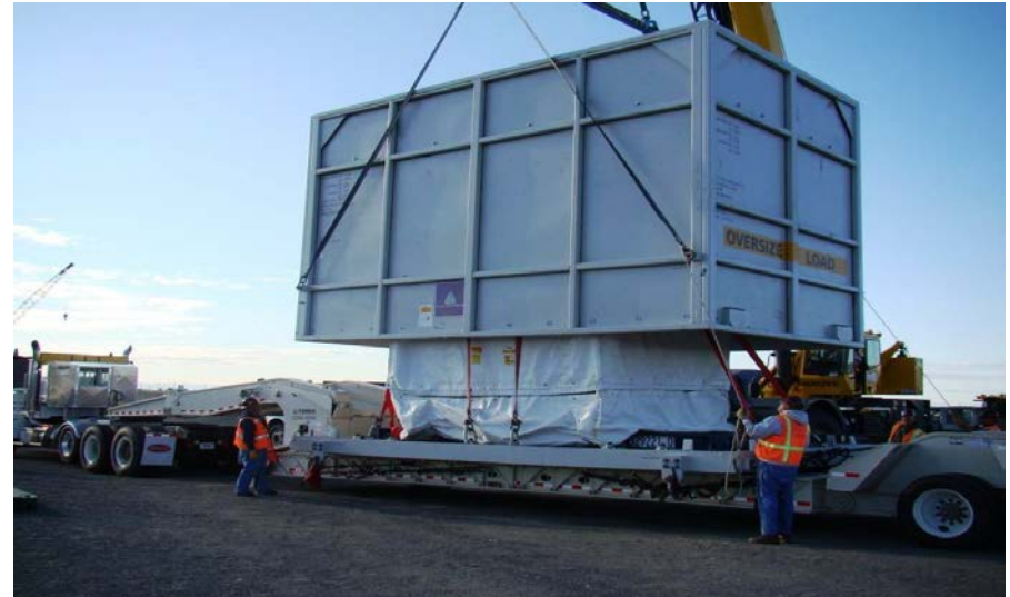
Large Box Load Out for Shipment to PFNW