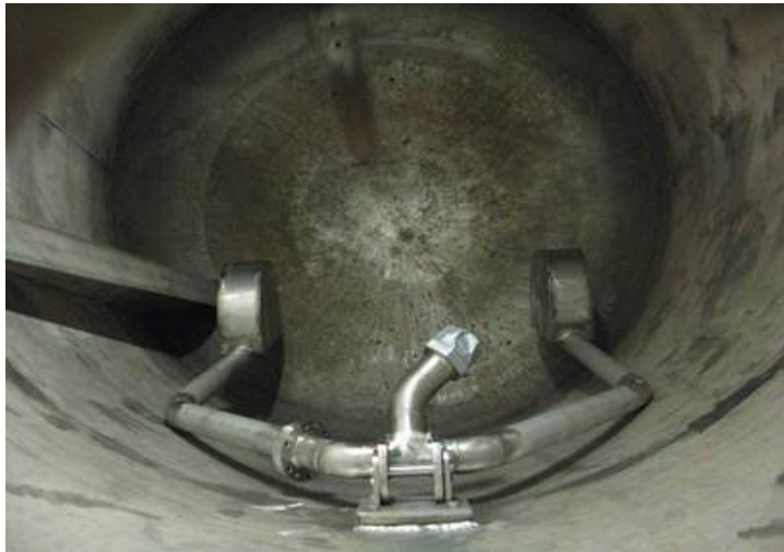
Sludge Transfer Cask Control Float