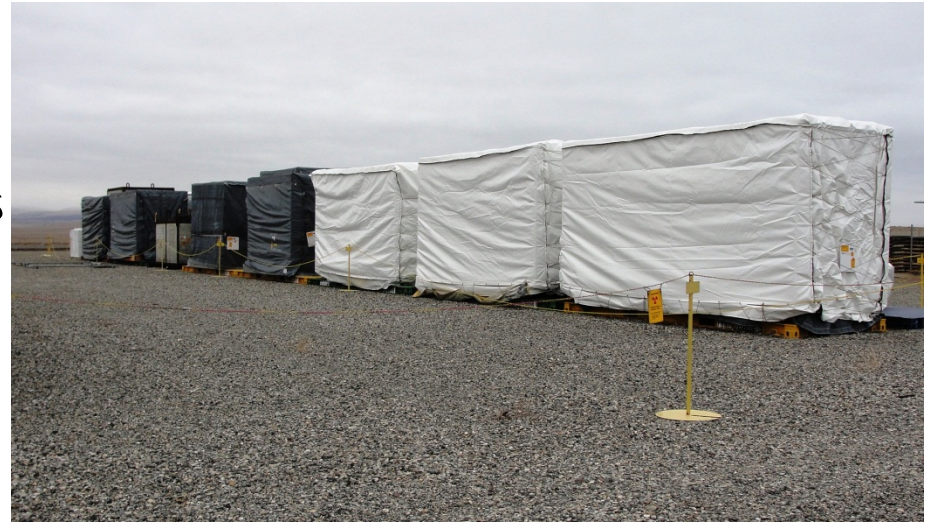
Covered Large Containers at CWC Expansion Area