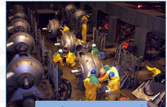
Cut & Cap Operations 5