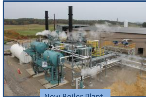
New Boiler Plant