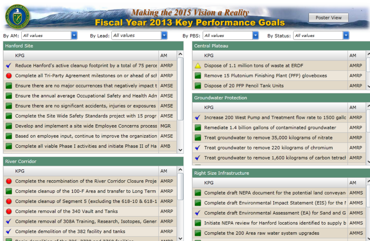
Fig. 1. Key Performance Goals Dashboard

These accessible, transparent measures of progress provide management and staff a clear sense of project direction.