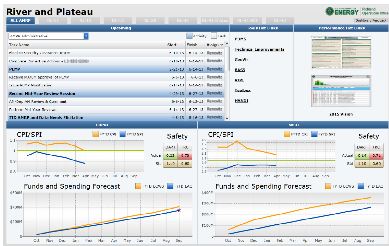
Fig. 3. AMRP Dashboard