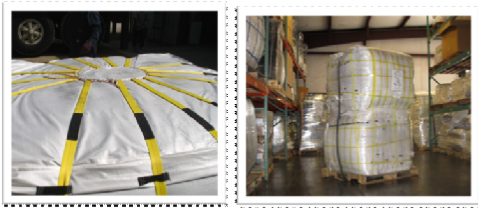
Closure details of flexible packages Pallet of 30 empty Flexible Packages

Other applications for flexible waste packaging that have been tested and proven in the USA DOE market, are Low Specific Activity (LSA) and Surface Contaminated Objects (SCO) wraps, and demolition debris bags. The demolition debris bags fit large dump trucks and are used to receive, transport and dispose of large quantities of lightly contaminated demolition rubble.