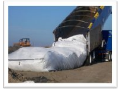
Demolition Debris bag being dumped