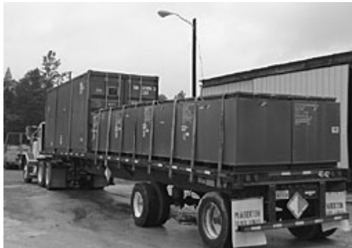
B25 Containers transported on flatbed

For many years in the USA, Low Level Radioactive Waste (LLW), contaminated soils and construction debris, have been transported, interim stored, and disposed of, using IP1 / IP2 metal containers. The performance of these containers has been more than adequate, with few safety occurrences. The containers are used under the regulatory oversight of the US Department of Transportation (DOT), 49 Code of Federal Regulations (CFR).