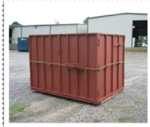
Standard loading frame for flexible packages