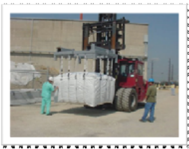
IP-2 Flexible Package

Other applications for flexible waste packaging that have been tested and proven in the USA DOE market, are Low Specific Activity (LSA) and Surface Contaminated Objects (SCO) wraps, and demolition debris bags. The demolition debris bags fit large dump trucks and are used to receive, transport and dispose of large quantities of lightly contaminated demolition rubble.