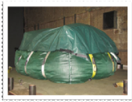
Flexible package used in testing at Wyle Laboratories, Huntsville, AL USA