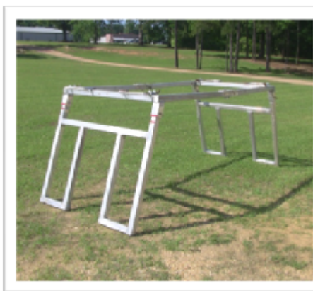
Lightweight or EZ loading frame

The training required to enable operators to position, and load, the packages is not extensive, but does require some training. Also, after the package is loaded, and closed, a tamper indication device can be attached to the closure zippers on the bags, for security.