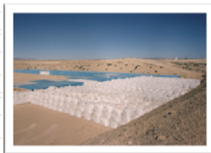
Stacked Flexible Packaging at NTS (Nevada Test Site, NV USA)

Flexible waste packages are able to conform, to some extent, to the space or cavity they are placed in, as in a repository or landfill for final disposal.