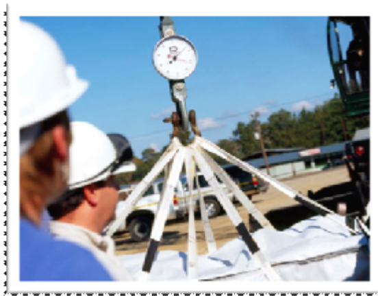
Weighing the package for a drop test

Flexible packages have been tested and certified to IP-1 and IP-2 standards per 49 CFR 173.411; stack test, and drop test. The IP2 test was performed to ensure that “construction debris” was included in the certification.