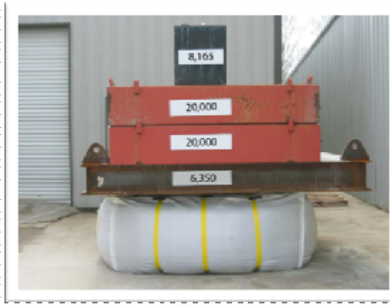
Stack test with 54,515 kg of weight