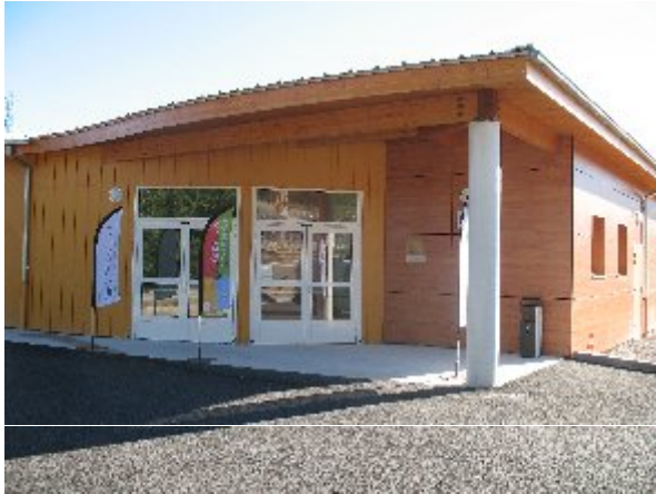
Figure 1. Communication Building 1220