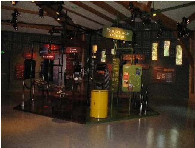
Figure 3 : Exhibition hall