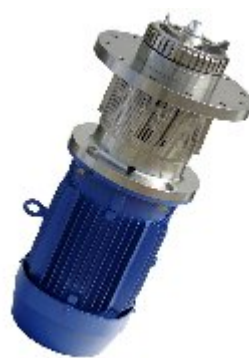
Fig. 1. Pre crusher for in tank batch processing

A pump transfers the pre crushed resin slurry to the next process step.