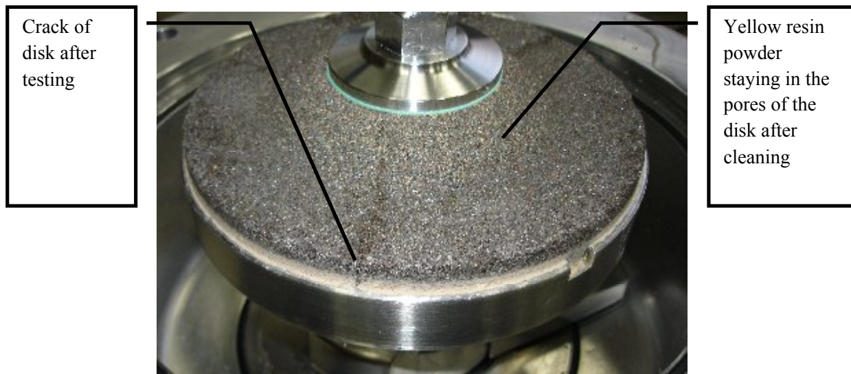
Fig. 3. Corundum disk from a corundum disk mill with a crack after 1 h of testing