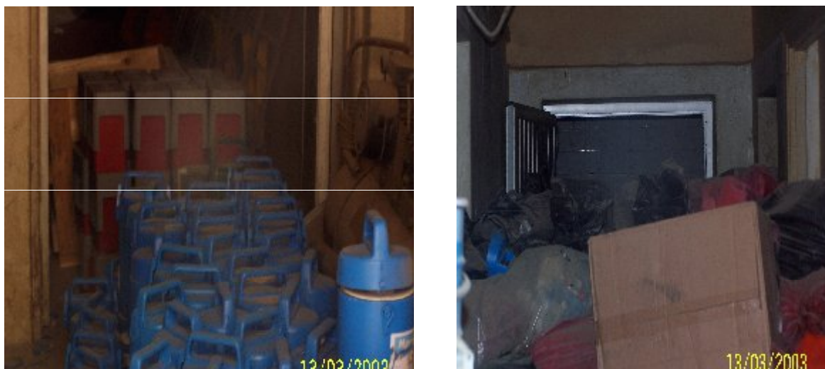
Fig.1. Accumulated waste from past research and medical institutes activities.