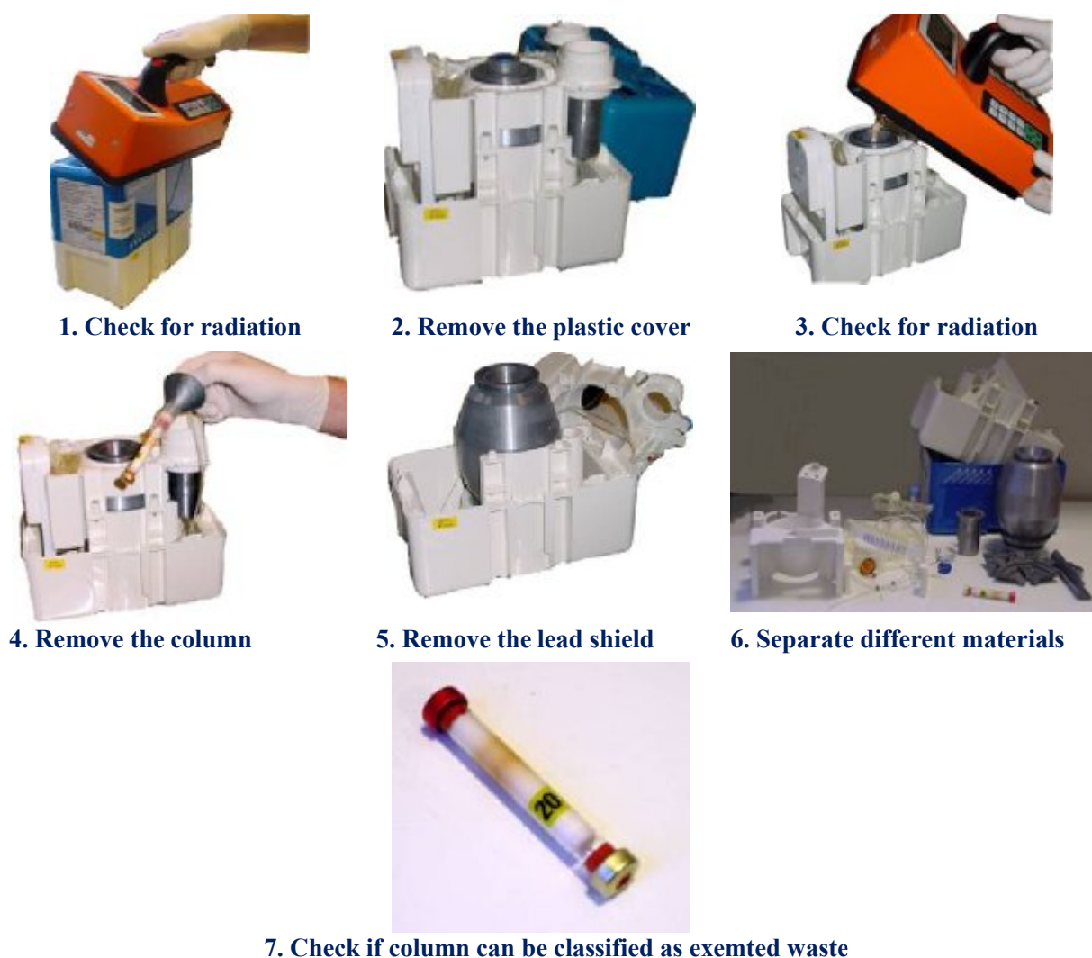
Fig.3. Procedure for management of spent Tc-generators.