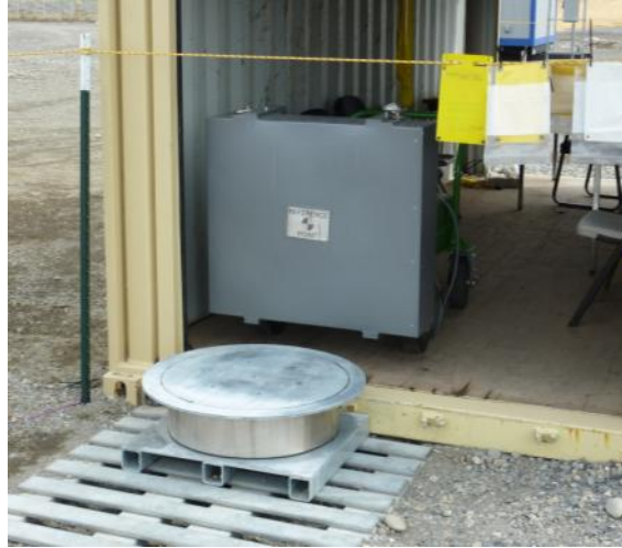
Fig. 2. Hanford Slab Counter Deployment

The counters were set up within a shipping container as illustrated in Figure 2. Exhumed waste drums were positioned outside the container on a turntable and measured for 20 minutes. The workstation (software interface) was located several meters from the counters to ensure minimal dose uptake to the operators.