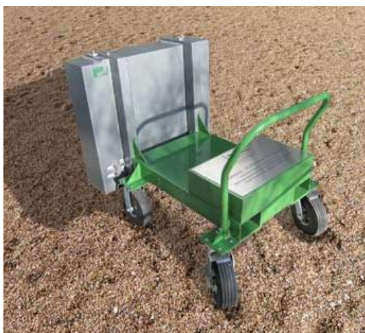
Fig. 1. Hanford Slab Counter.

Two systems are used, each comprising an array of He-3 tubes embedded in polyethylene, with associated counting electronics. The counters are mounted onto transportable carts that are engineered to allow easy set-up and relocation / reconfiguration (see Figure 1).