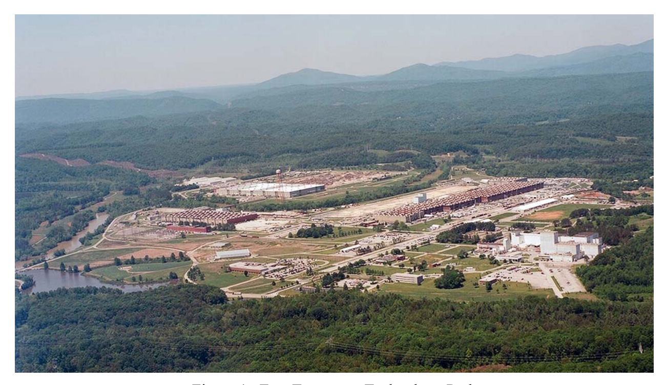
Figure 1. East Tennessee Technology Park

The purpose of this Contract is to decontaminate and decommission (D&D) the major facilities at ETTP, which include Bldgs. K-25, K-27, and K-1037, and other facilities; remediate any associated environmental media; and continue DOE Environmental Management activities currently ongoing at ORNL and the Y-12 NSC. Figure 1 is a photograph of many of the facilities and grounds undergoing D&D and environmental remediation at ETTP.