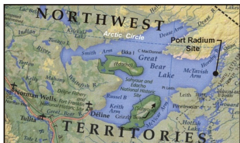
Fig. 1: Location Map

The “Port Radium” mine site is located just below the Arctic Circle, on the eastern shores of Great Bear Lake in the Northwest Territories. The nearest major city, Yellowknife, is approximately 440 km south of the site, while the closest community Déline is located about 265 km west of the site (see Fig. 1).