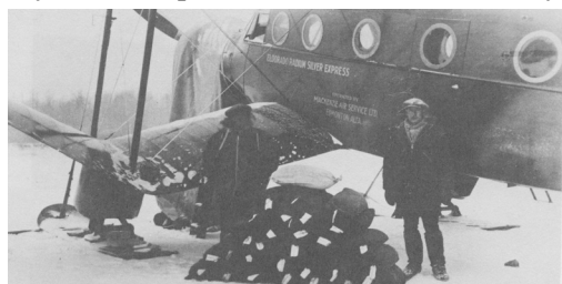
Fig. 2: Early Transportation of Concentrate

In the early days of radium and uranium mining, ore was transported by plane, then by boat and barge across the waterways, while in later years, ore/concentrate was transported off-site via barge to Sawmill Bay and transported to southern Canada by air transport (see Fig. 2,3,4). [2,6]