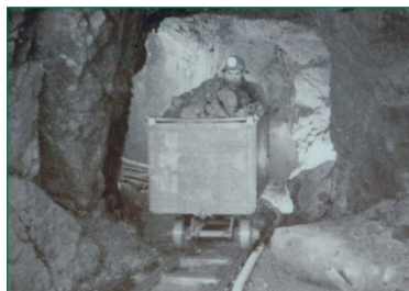
Fig. 6: Hand Trimming

The early miners were exposed to very high levels of radon and its radioactive decay products at levels 100's of times higher than levels in modern mines. There was no mechanical ventilation in the mine until 1949 and the miners worked in close proximity to the ore (see Fig. 5, 6).