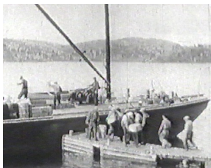
Fig. 7: Barging ore and concentrate

A pilot dose reconstruction although challenging and requiring numerous assumptions, including information from oral histories, concluded that a dose reconstruction could be performed. A wide range of information was available including, reports on historical site activities and production records, data on the transportation system, as well as community supplied information including oral histories with respect to specific individual activities of Déline Dene band members and their families. The review of this information confirmed that the exposures of the Déline were limited to those activities associated with the handling of ore and (gravity) concentrate along the transportation route. The feasibility study developed (annual) dose estimates for the Déline Dene who transported ore and concentrate (ore carriers). The highest annual dose rates were estimated to be for the deckhands who traveled from Port Radium to Great Bear River during the 1930s and early 1940s.