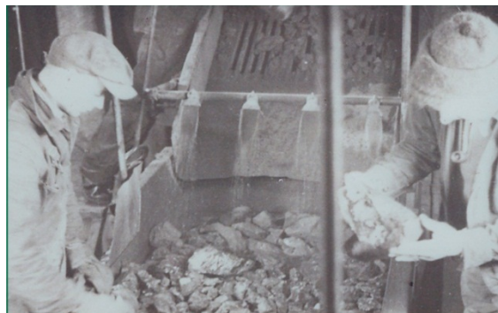
Fig. 5: Hand Sorting