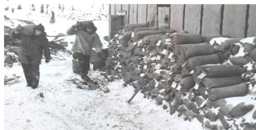
Fig. 3: Carrying Concentrate