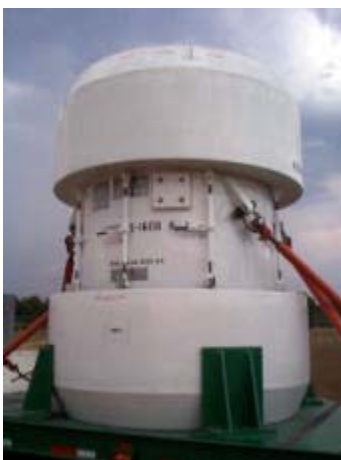
Fig 2. Energy Solutions 10-160B has current NRC and DOE Certificates

certified shipping packages. The fleet of existing certified packages is in excess of 7,000 units and includes the NAC LWT, 10-160B (see Figure 2), GE2000, Hanford Unirradiated Fuel Packages, 9975s, ES 3100s, 9977s, 9978s, as well as many other packagings. In order to meet projected DOE Complex schedules and comply with regulatory and programmatic requirements, the DOE fleet of shipping packages must be adequate in number, maintained, and certified to meet programmatic needs.