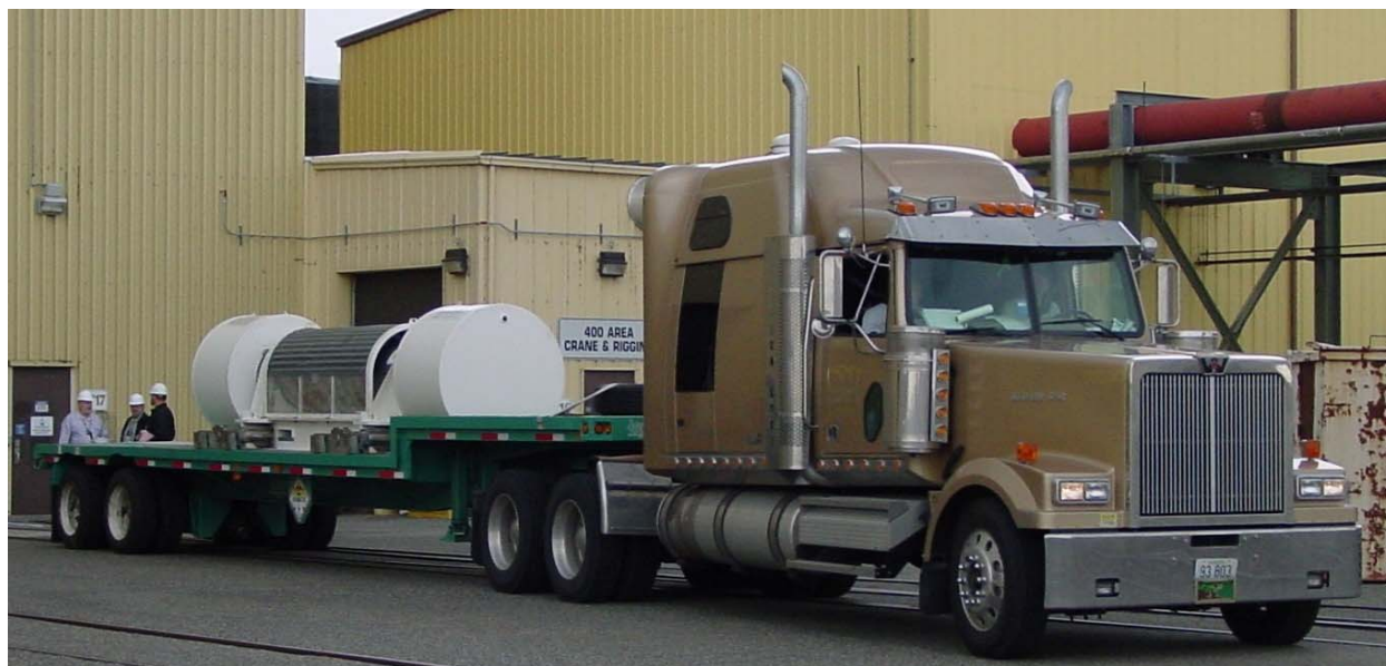
Fig 1. The T-3 being used to ship Fast Flux Test Facility sodium bonded fuel.

There are numerous reusable 7A Type A and Industrial Packagings (e.g., sample cases, intermodals, liquids drums, and freight containers). The PSMC would be well suited for their staging and maintenance/repair for continued use. The two locations could also function as a pre-delivery staging/assembly area for commercially available packaging (e.g., waste boxes shipped flat from the manufacturer and assembled onsite). Examples of casks for staging include the Fort Saint Vrain (FSV)-1 cask and T-3 (see Fig. 1).