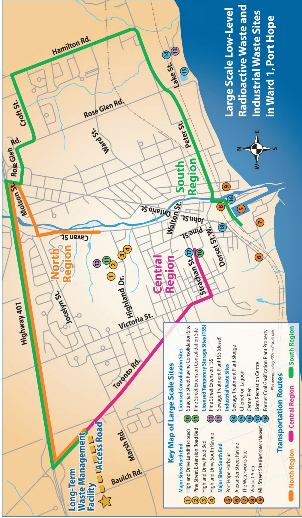
Figure 1: Transportation Routes