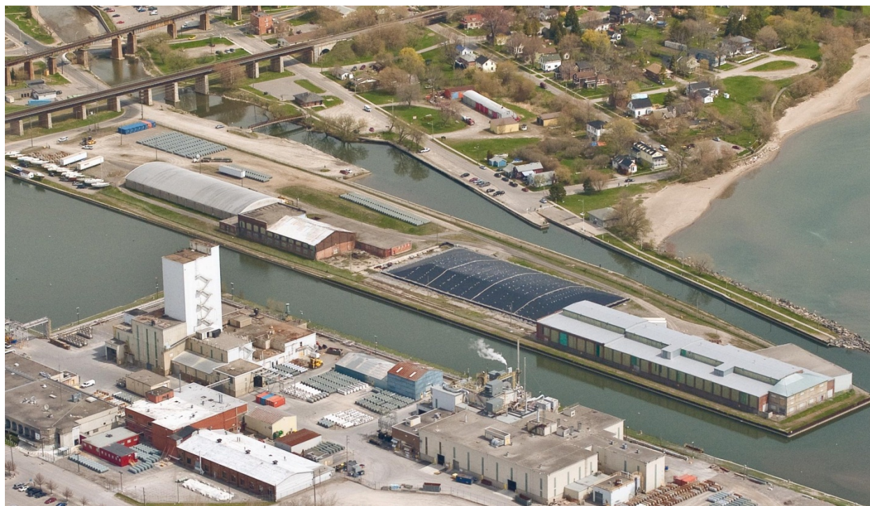
Fig. 3: Centre Pier present day.

Over the years as industrial production changed, buildings were demolished and the remaining buildings serve as facility storage for Cameco. During the remediation at the Port Hope Water Treatment Plant, a temporary storage site (TSS) containing 19,754 m 3 of low-level radioactive waste (LLRW) was developed on Centre Pier. A current photo of Centre Pier is presented as Fig. 3.