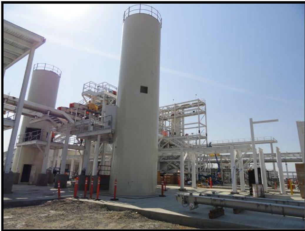
Figure 10 - 2W P&T Lime Storage Silo