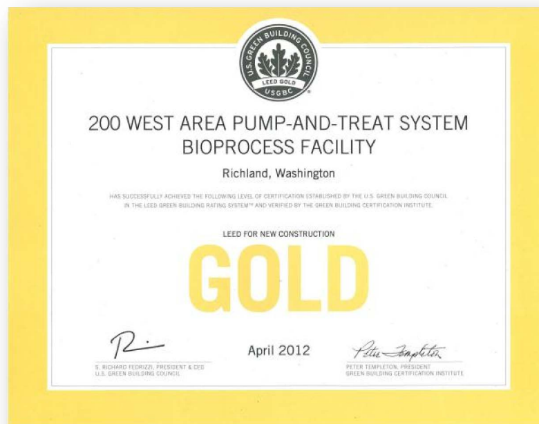
Figure 4 - LEED Gold Certificate

The 2W P&T Facility's LEED gold certification for sustainable design was the first gold certification (Figure 4) in the DOE Office of Environmental Management complex of sites that conducted nuclear weapons development and government-sponsored nuclear energy research.