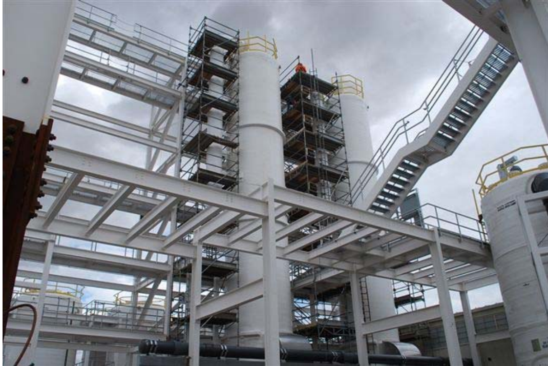
Figure 12 - Scaffold Erection at the Air Stripper Towers at 2W P&T