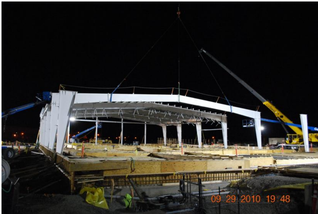
Figure 11 - Steel Erection of Rad Building at 2W P&T

The project received multiple design-related requests through the formal submittal process as a result of construction interferences and in response to the contractor's request for information. Waiting to incorporate the technical solution into revised issued-for-construction drawings through the design change notice process caused delays to the construction progress/schedule. As a result, the Project implemented a "redline" approval process for minor design field changes, which provided an expeditious way to respond to the contractor's needs without hindering production performance. Figure 11 and Figure 12 depict steel and scaffold erection activities completed using the "redline" process.