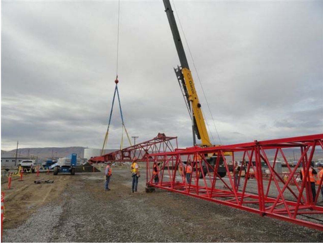
Figure 6 - Assembly of 100-Ton Crane at 2W P&T