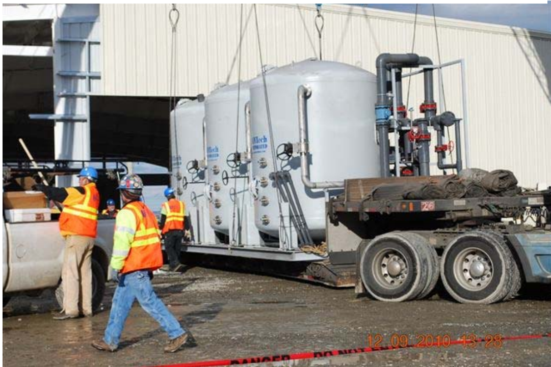
Figure 7 - Delivery of Avantech® IX Tank Skid for the 2W P&T Project