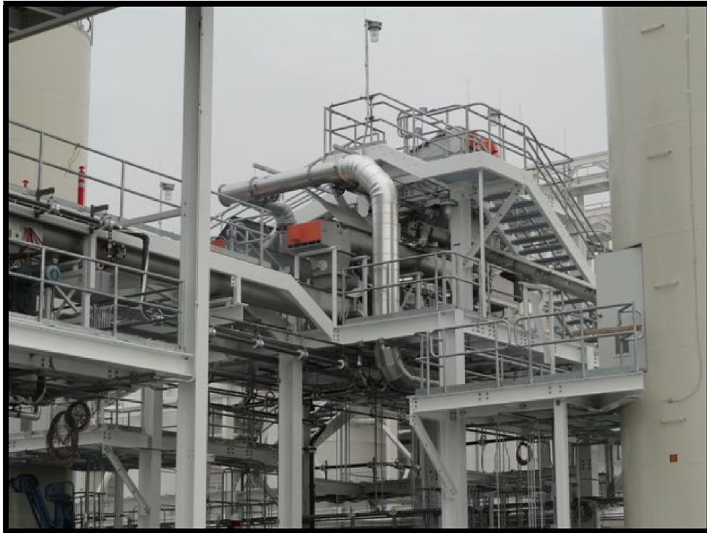
Figure 9 - 2W P&T Lime System Process Piping Overview