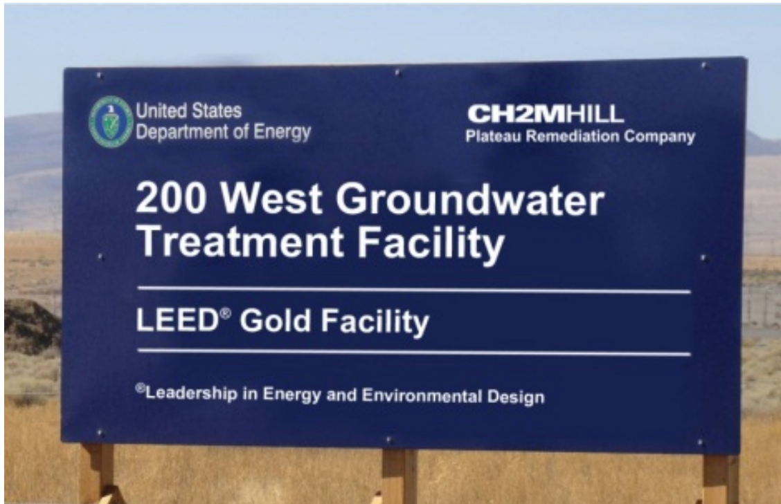
Figure 1 - LEED Gold Facility