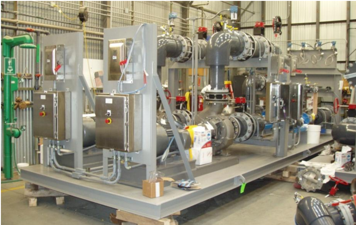
Figure 13 - 2W P&T Fluidized Bed Reactor Pump

Plastic debris left behind from the fabrication process of several fiberglass tanks resulted in multiple Bio Plant influent pump and Fluidized Bed Reactor pump (Figure 13) strainer shutdowns, which required corrective maintenance evolutions to remove the plastic and impacted progress on the Operational Test Procedure. Although internal tank inspections were conducted for foreign objects, the condition of the internal plastic liner of the tank was not readily visible via the manway access.