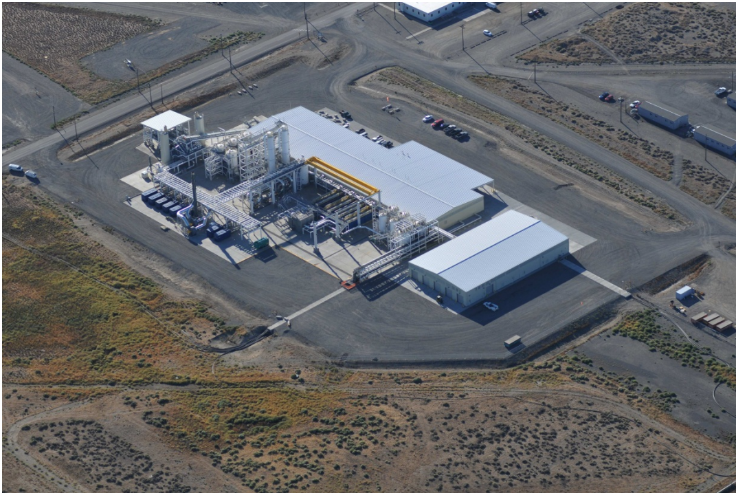
Figure 3 - 2W P&T Facility

The 2W P&T Facility (Figure 3) provides treatment capacity of 409 million liters (108 million gallons) per month (equivalent to 108 municipal water towers), which equates to approximately 5 billion liters (1.3 billion gallons) of water treated annually. The 2W P&T Facility will treat 91 billion liters (24 billion gallons) and remove between 35 million – 50 million grams (77,000 – 110,000 pounds) of carbon tetrachloride over its 25-year operational life.