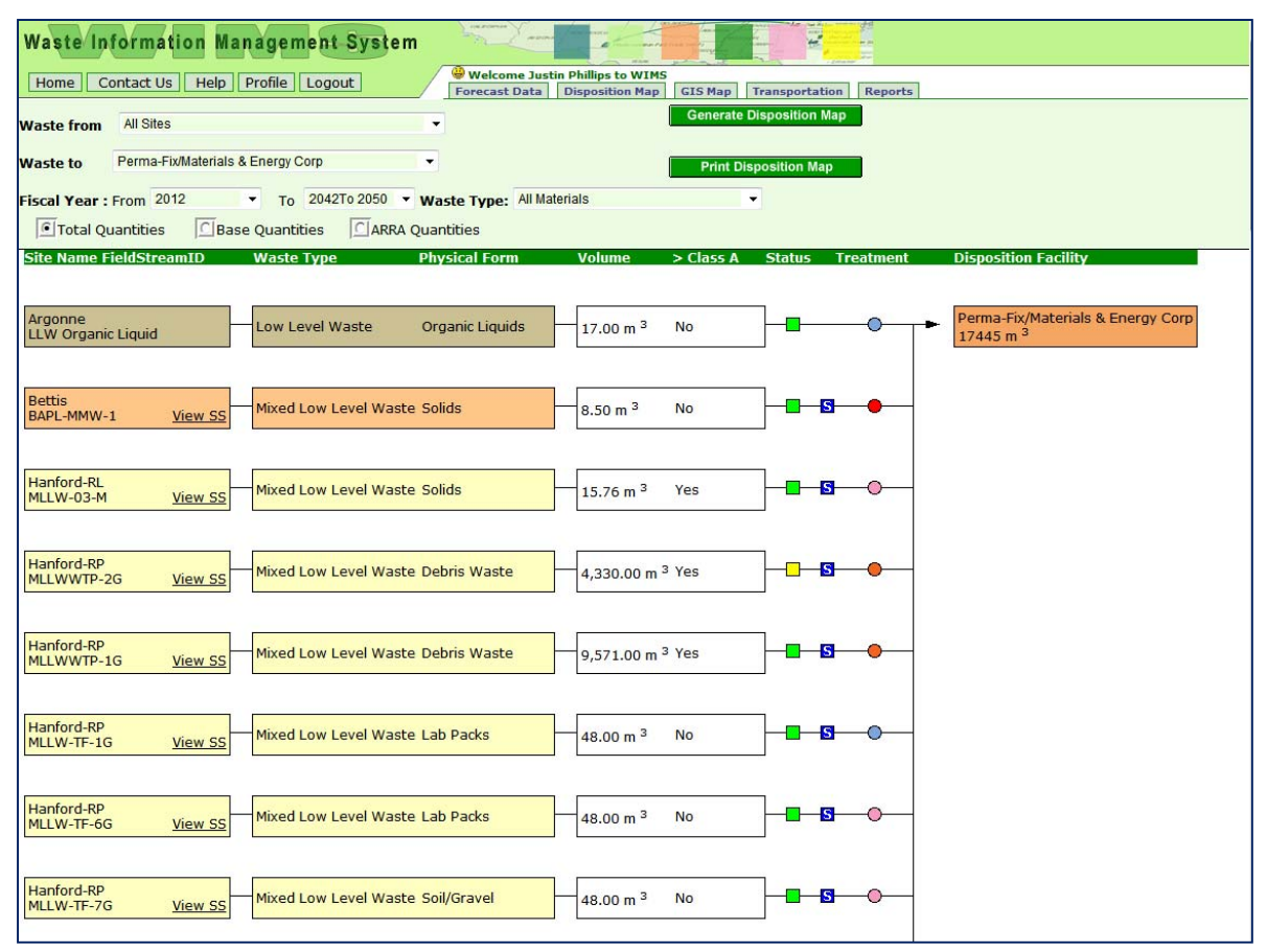
Fig. 2. The disposition map screen shot is displaying a sample of all the waste forecasted to be shipped to Perma-Fix Materials and Energy Corp for disposition between the years 2012 and 2050.

Quantities: Total (includes both base quantities and ARRA quantities)