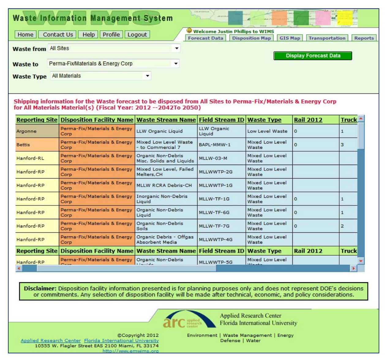
Fig. 4. The transportation forecast data screenshot displays a sample of the waste forecasted to be sent to Perma-Fix Materials and Energy Corp, for disposal from all DOE sites by number of rail, truck and intermodal shipments.