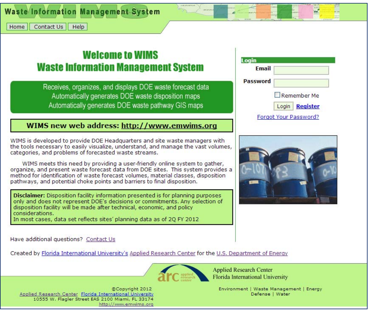
Fig. 1. WIMS home page provides a general description of the system as well as tabs to navigate to the forecast data, disposition map, GIS map, transportation module, and the reports module.

The forecast data screen is accessed by clicking on the forecast data tab at the top of the home screen. Once the desired filtration choices have been made from the available drop down menus, clicking on the "Display Forecast Data" button will generate a table that displays the requested data.