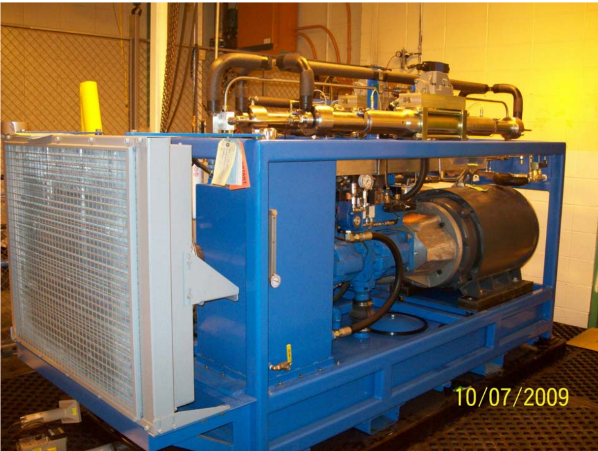
Fig. 3. Nitrocision® 6000 skid.

Nitrocision® LLC, together with WVES and Cryotech International, designed the run of vacuum-jacketed piping that would convey the liquid nitrogen from the 49,000 liter (13,000 gallon) supply tank (outside of the MPPB) to the Nitrojet 6000 skid and chiller inside the MPPB. Additionally, the system relies on a clean, regulated 7.0 kg/cm (100 psi) of air to turn rotating motors on the in-cell working tool. The system was originally connected to the Plant air supply that later turned out to be problematic from both a supply and quality perspective. The existing MPPB air supply was moist and not clean, and fluctuated in its delivery volume based on demand in the rest of the building. Supply air issues caused operational down time that was not initially recognized by the team as being air supply related.