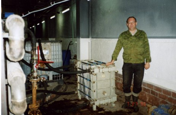
Fig. 4. General view of experimental electrochemical stand

electromembrane technology eliminates the need in the precipitating agent supply (ammonia water), prevents the accumulation of waste nitrate solutions, and produces the uranium concentrate (finished product) with high physical-chemical characteristics. Developed technology was successfully tested at the experimental electrochemical stand with the capacity of 50 L/hr by the stripped product. In 2006 a pilot membrane electrolyzer with the capacity of 0.4 m 3 /hr by the stripped product has been constructed (see Fig.4).