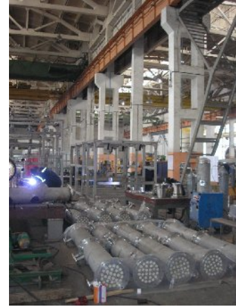
Fig. 7. General view of the industrial facility in processing building-up

In Fig.8 the general layout is shown of our mobile cementation facility for LRW. Capacity facility on cement solution– not less 0.5 m 3 /h.