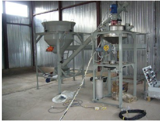
Fig. 8. General view of mobile cementation facility

At SUE MosSIA “Radon” the technology for processing regeneration solutions of the ion exchange LRW decontamination stage has been developed and an experimental electromembrane complex has been constructed consisting of two electromembrane units as follows: