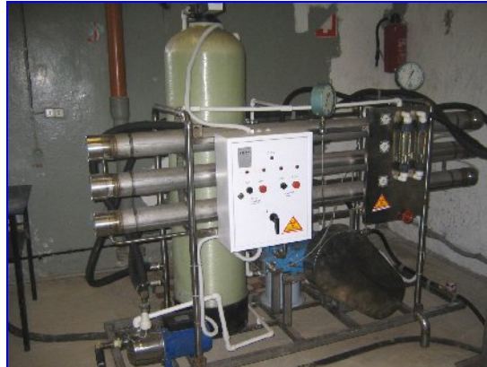
Fig. 2. General view of reversal osmosis unit 10 m 3 /hr

Since 2010 SUE MosSIA “Radon” started to operate the new LRW industrial decontamination facility with the throughput up to 10 m 3 /hr where the reverse osmosis, filtration, and selective sorption techniques are incorporated. General view of the reversal osmosis unit is given in Fig.2. Capacity industrial facility – 10 m 3 /hr.