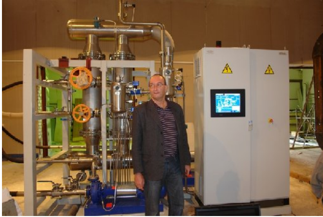
Fig. 6. Full-scale industrial prototype for the suspended solids concentrating