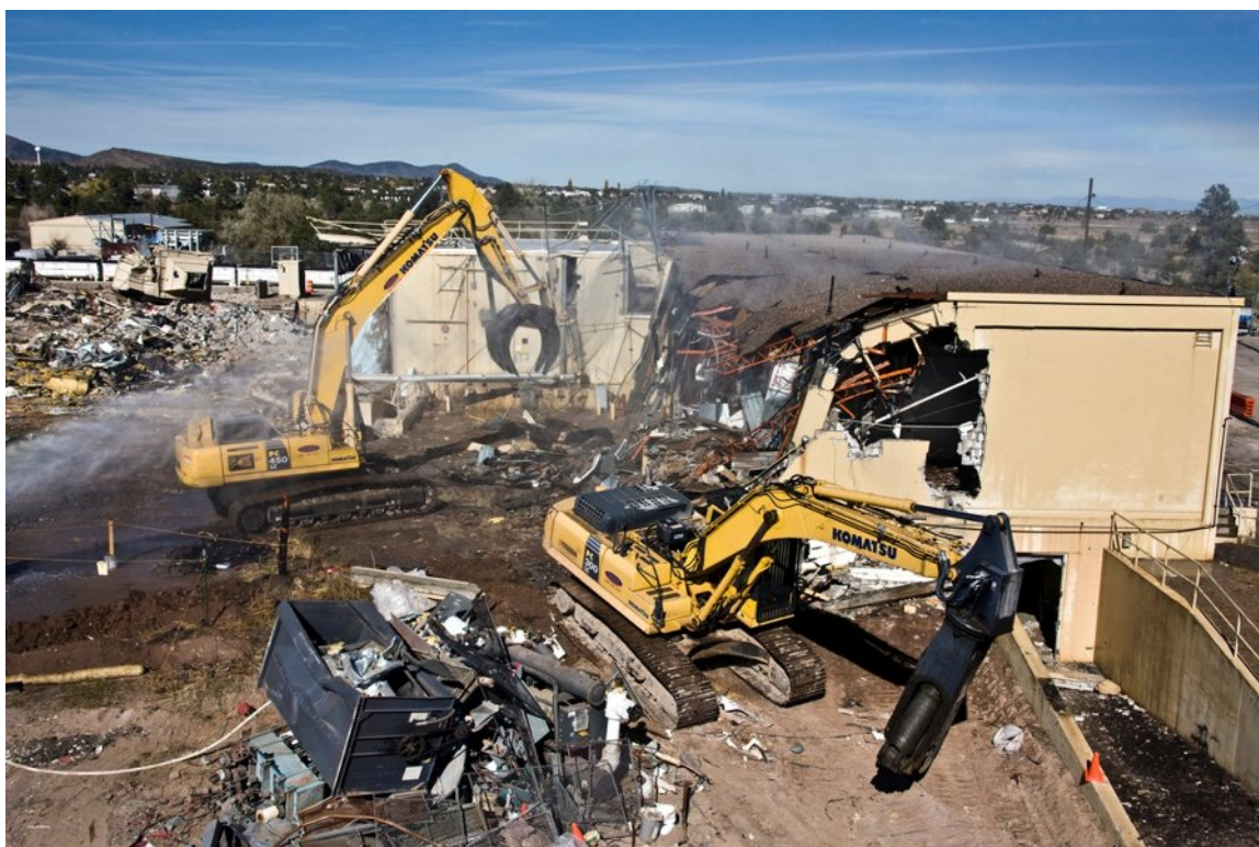
Figure 2. Building demolition using excavators equipped with grapples and shears.

Once abatement was completed, demolition of the primary structure could proceed using excavators equipped with grapples and/or shear attachments. Most structures were one to two stories in height. Long-reach excavators were used to slowly collapse structures to grade and to strip concrete and masonry from steel framing. The shears were used to separate large pieces of metal from the structure and to size reduce waste for efficient packaging.