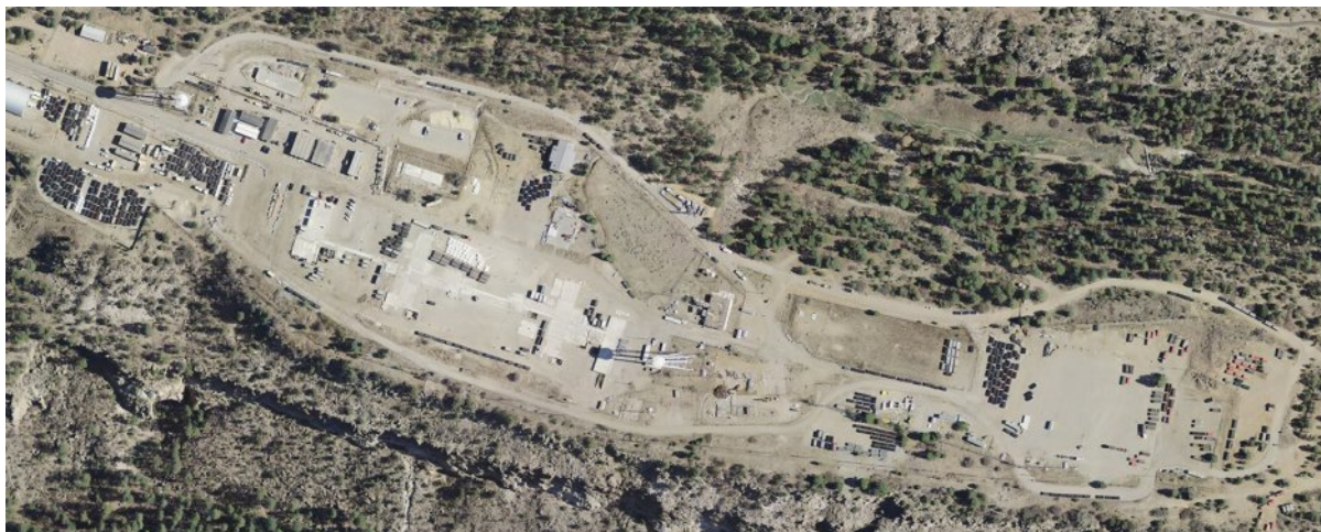
Figure 4. Overhead view of TA 21 (circa 2011) after building demolition.

Figure 4 shows the striking change this effort made to TA-21. All of the major buildings have been removed, unencumbered access to the SWMUs that are required to be cleaned up by the Consent Order with the state of New Mexico, has been achieved, and a significant portion of the mesa has been prepared to support a process that will eventually transfer this land from federal government control for further use.