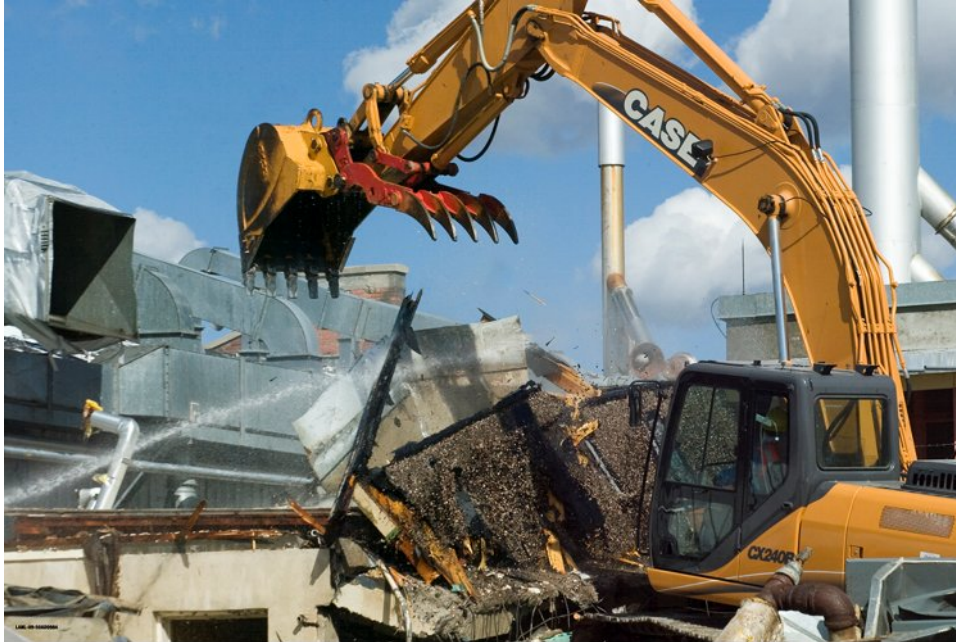
Figure 3. Dust suppression using a fire hose.