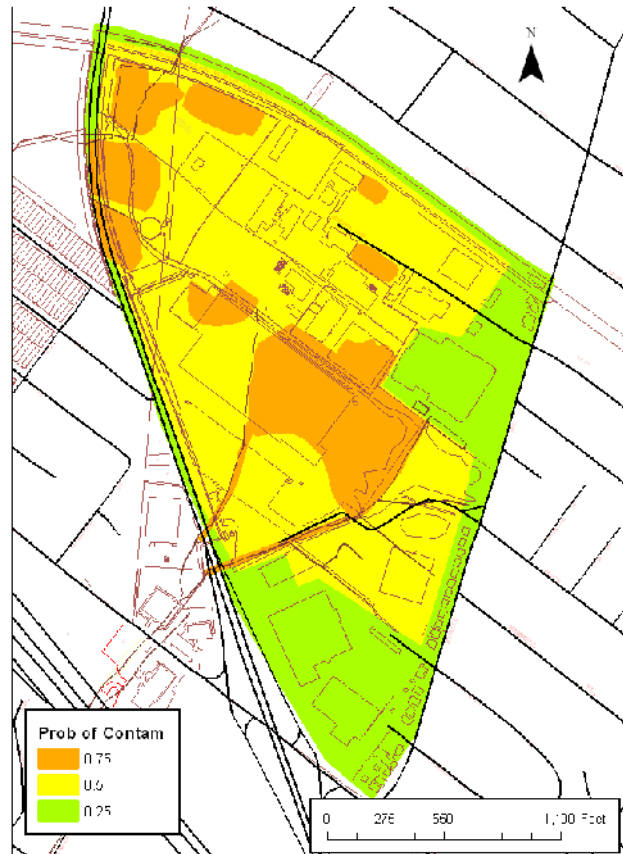
Fig. 2. ICSM for Maywood.

Analyzing the Maywood historical data was challenging. Some data existed in spreadsheet format, but much was only available as scanned reports. Location information existed as State Plane coordinates in some cases, while in other cases local coordinate systems were used, with location information only as demarcations on a scanned map. Significant effort was invested in developing data sets suitable for volume estimation, based on available historical data. This effort included capturing data contained in scanned reports in a suitable electronic format, as well as rectifying coordinate information for locations where data had been collected. In the latter case, GIS software was used to geo-reference scanned report figures so that approximate State Plane coordinates could be determined for each station.