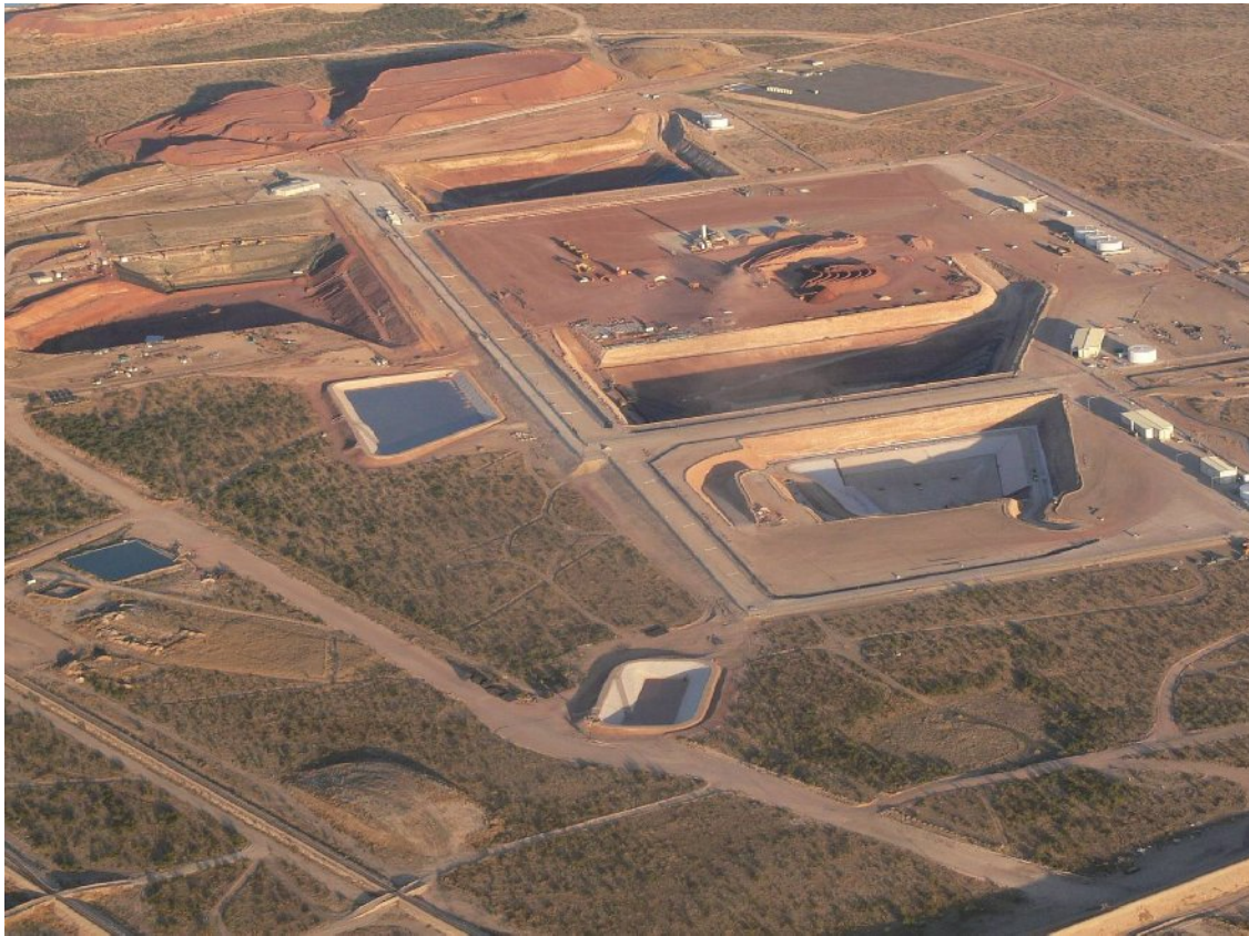
Fig 1. Aerial Photo of WCS LLRW Disposal Facilities (October 2011).

An aerial photograph of the complete WCS facility (the new LLRW disposal facilities and some WCS previously existing facilities) is presented in Figure 1, below.