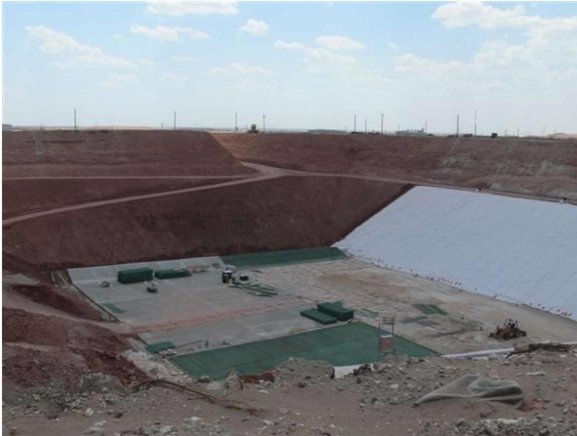
Fig 3. Installation of the One Foot Concrete Barrier.