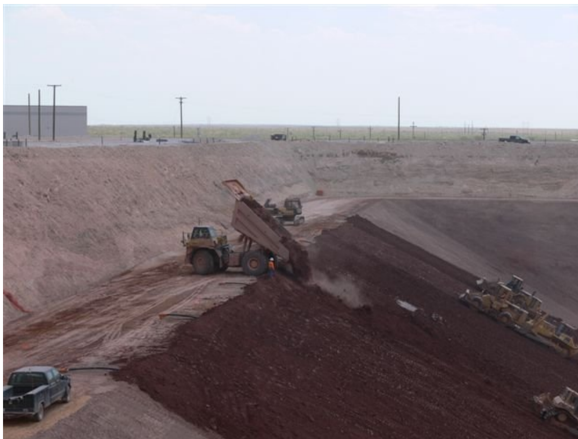
Fig 2. Installation of the Three Foot Clay Liner.

Finally during construction, compacted clay moisture and density were tested in-place an average of 20 times for each 15 cm thick layer of the 1.16 hectares liner constructed in the CWF landfill. If results did not fall within the acceptability envelope, the clay’s moisture was adjusted and it was re-compacted until acceptable results were measured. A total of 24 hydraulic conductivity tests were conducted on undisturbed samples of each 15 cm layer of the liner. All samples performed better than the required 4 \times 10^{-9} cm/sec.