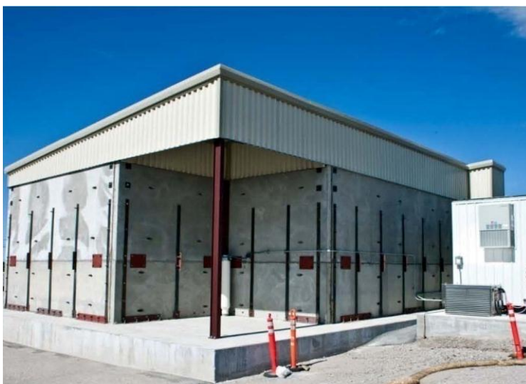
Figure 4. High-Energy RTR unit at LANL.

LANL has provided support to CCP in expanding capabilities for TRU waste characterization. These include refurbishment of a second RTR unit for NDE of drums and a new high-energy RTR (HE-RTR) unit for NDE of lead-lined drums and SWBs, a new Super-HENC unit for NDA of SWBs, and enhanced HSG sampling and analysis. Installation and readiness of all of the new characterization units have been completed, and audits for the new NDE and NDA equipment have been scheduled by CCP. Figure 4 shows a photograph of the new HE-RTR unit at LANL.