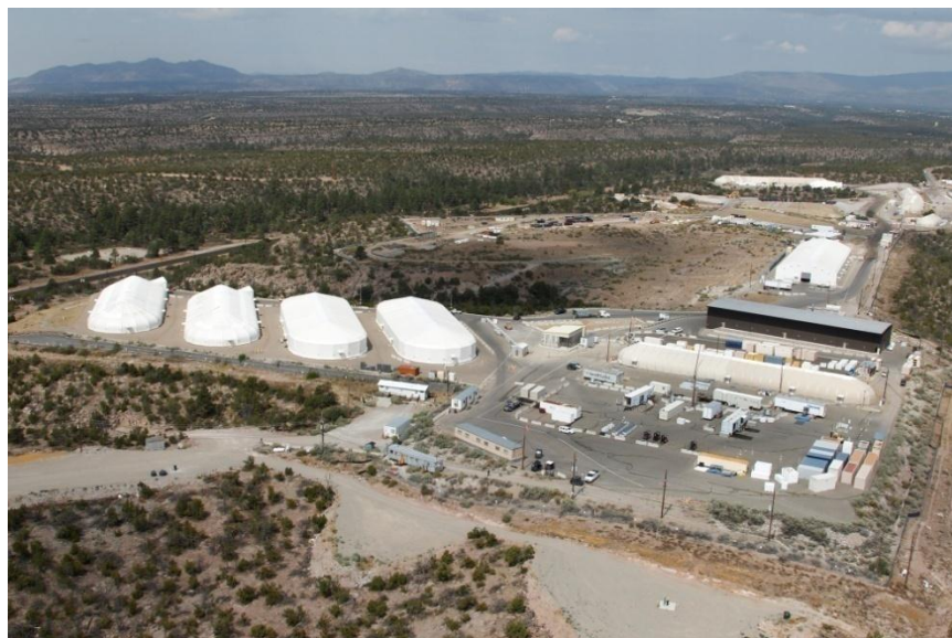
Fig. 1. Aerial photograph of TA-54 Area G (from the east).

The LANL TRU inventory is composed of a variety of waste forms (debris, sludges, cemented wastes, contaminated metal items, soils, etc.) and a variety of container sizes. Container sizes include 55 gallon drums, 30 gallon drums, drums overpacked into 85 gallon or 100 gallon drums, standard waste boxes (SWBs) with a capacity of 1.89 \text{ m}^3 , fiberglass-reinforced plywood (FRP) boxes of various sizes (some as large as 57 \text{ m}^3 in volume each), metal boxes of various sizes, and metal spheres up to about 1.8 m (6 feet) in diameter.