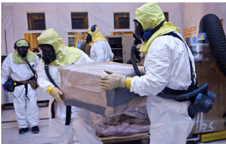
Fig. 3. Repackaging items in an oversize waste box.

assay (NDA) using High Efficiency Neutron Counter (HENC) units, and headspace gas sampling (HSG) and analysis, including SUMMA ® sampling.