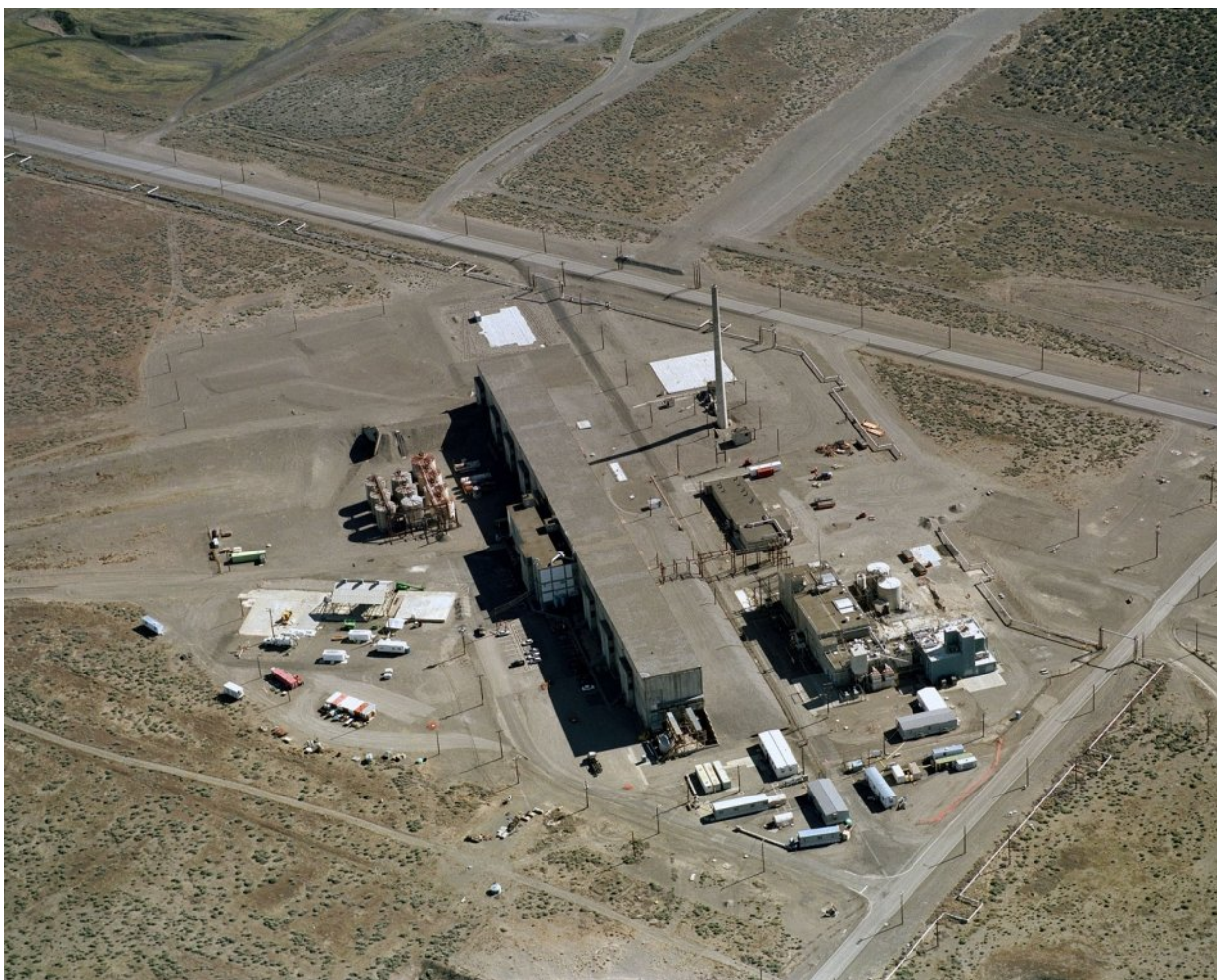
Figure 1. Aerial Photo of U-Plant

In February 2009, the Remedial Design/Remedial Action Work Plan for the 221-U Facility (RD/RAWP), DOE/RL-2006-21 was approved by DOE and the two joint lead regulatory agencies (EPA and Ecology). In order to reduce redundancy, the lead regulatory agency position was changed to just be the EPA for the canyon building regulatory interface. The RD/RAWP describes the design and implementation of the remedial action process for remediation of U-Plant pursuant to the ROD. The RD/RAWP outlines and discusses grouting of U-Plant in greater detail. U-Plant is shown in an aerial photo in Figure 1.