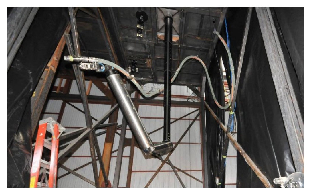
Figure 3: RDA during testing of bulk hose management