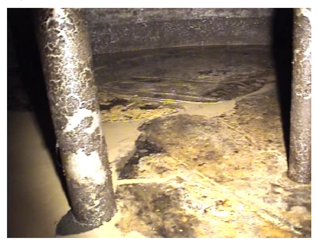
Figure 1: Internal view of resin vault

Internal views of two of the four different tanks (figures 1 and 2) give some idea of the difference in their internal structure. The pictures do not give any idea of the range of waste forms that exist below the level of the supernate. The waste includes solids, liquids, resins, sludges and a diverse range of miscellaneous components.