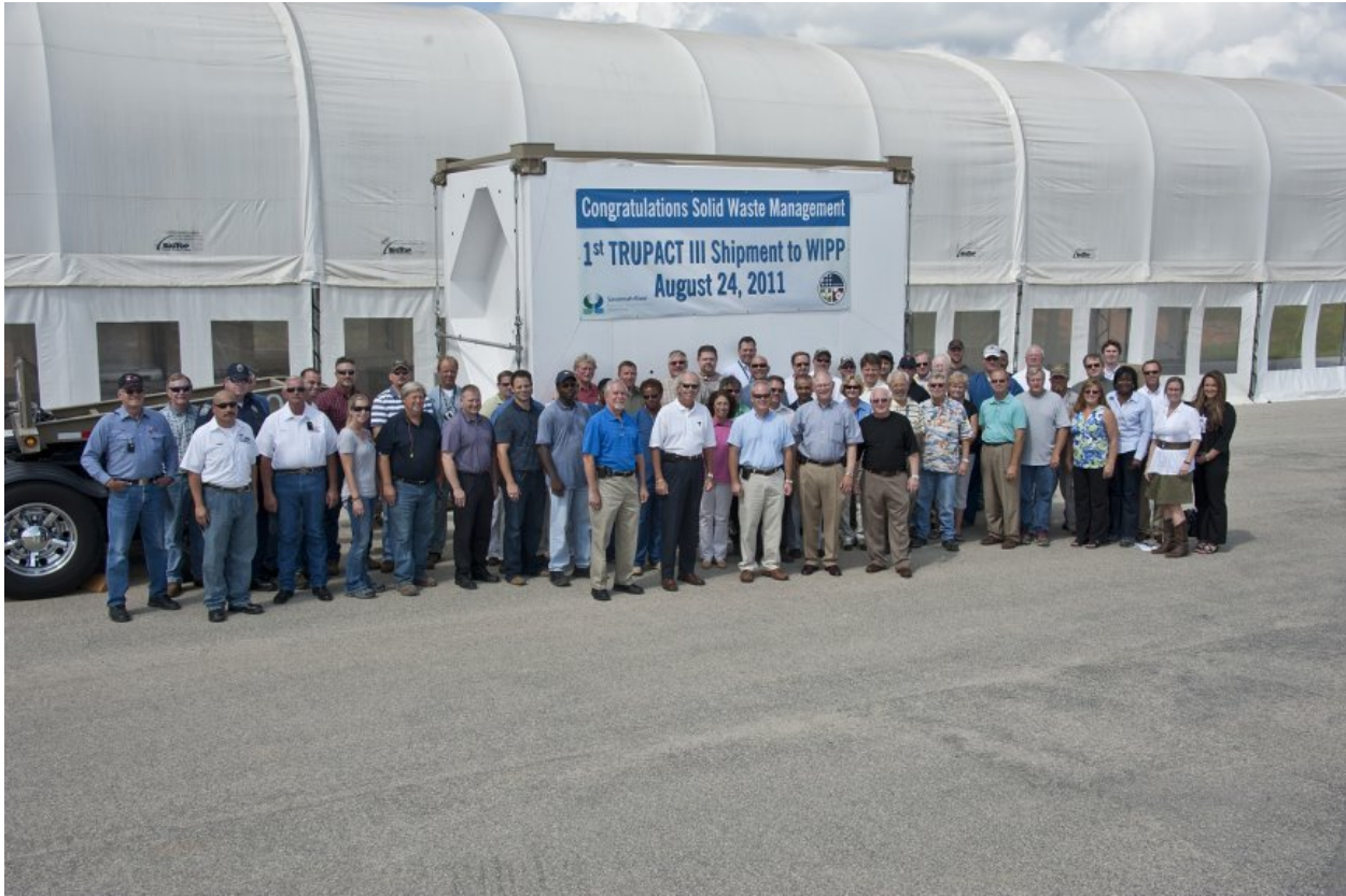
Fig. 2 Photograph of the first TRUPACT-III shipment from the Savannah River Site.