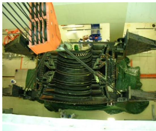
Fig. 1: Metal scrap from nuclear power plants