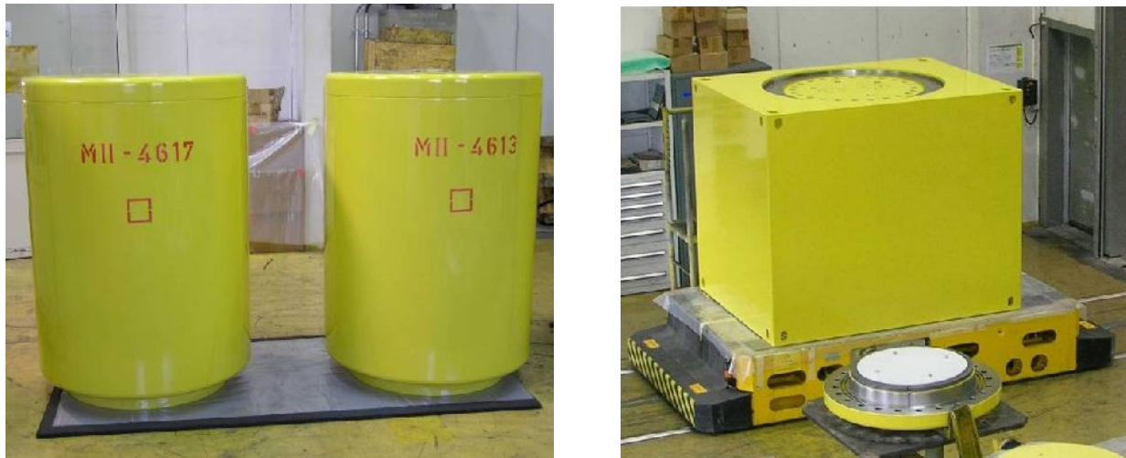
Fig. 4: MOSAIK ® and Cast Iron Container

More than 5,500 casks manufactured from Ductile Cast Iron (DCI) in cylindrical or cubic form licensed for the German ILW Konrad repository have been manufactured with a recycled metal content of between 15 % and 25 %.