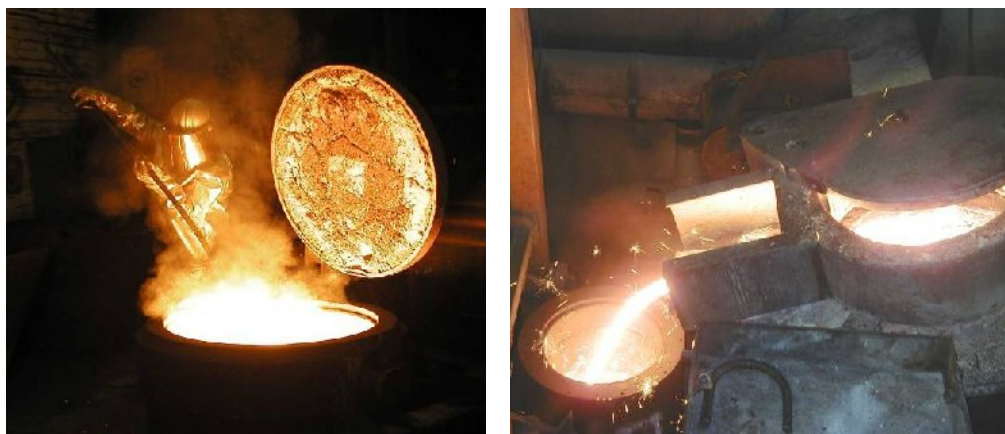
Fig. 3: Casting to 1 t ingots

The melt is usually cast into pre-heated, cylindrical permanent moulds, also called diecasts. The form of a diecast was designed so that the solidified metal ingot is approximately the same size as the inner dimensions of a 200 l drum. The diecasts consist of an outer steel jacket with trunnion for handling with a sintered refractory crucible liner. The crucible liner is manufactured foundry-compliant and is thermo-mechanically very stable. Thus the diecasts can be used as a permanent mould for a longer period which contributes to minimizing secondary waste (Fig. 3).