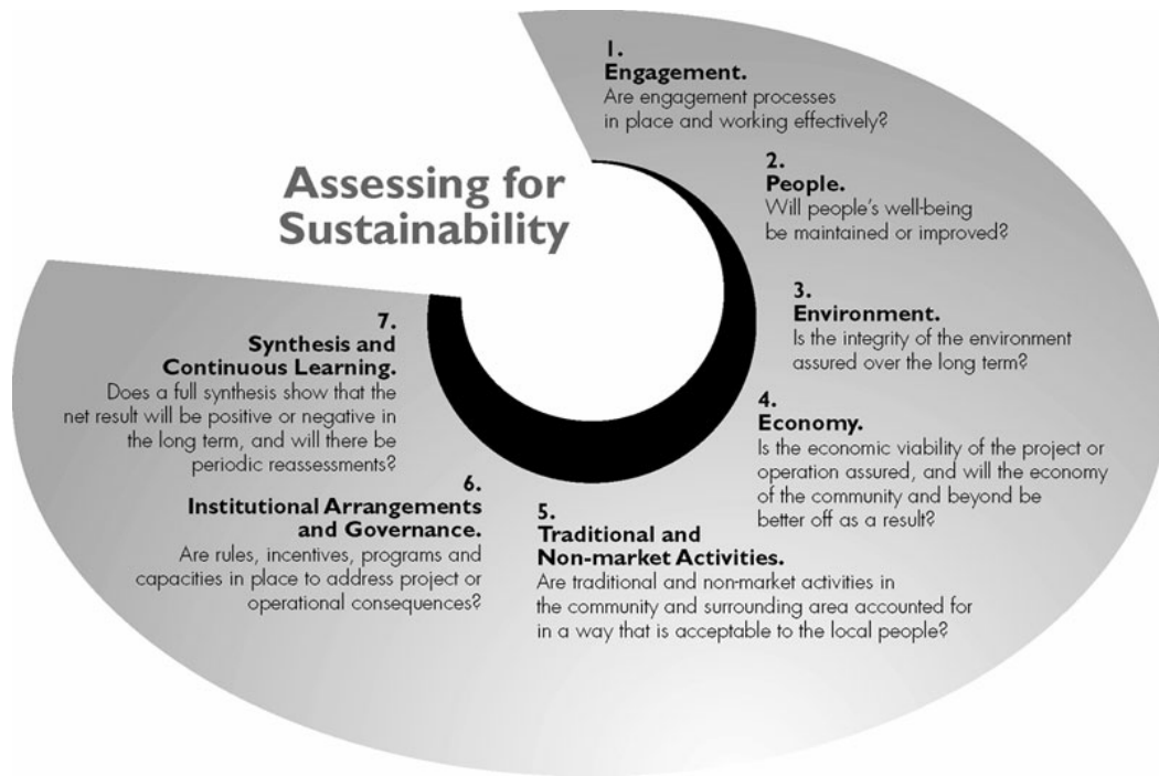
Fig. 2 – The Hierarchy of Objectives, Indicators, and Metrics for Sustainable Mining Development.

There is no perfectly sustainable project or system; rather, with balancing of the economic, social and environmental factors, an optimization process allows continuous adjustment to achieve improved performance in all three of the pillars of sustainability. There are some who question whether or not resource recovery can be sustainable, because it removes a resource from nature which will no longer be available for future generations. However, sustainability economists have developed a use of the Seven Questions from which falls a hierarchy of objectives, indicators, and specific metrics for sustainable mine development. This hierarchy is presented below in Figure 2.