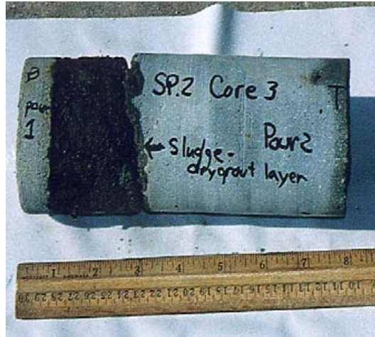
Figure 4: Cementitious Material Surrogates used for Property Testing