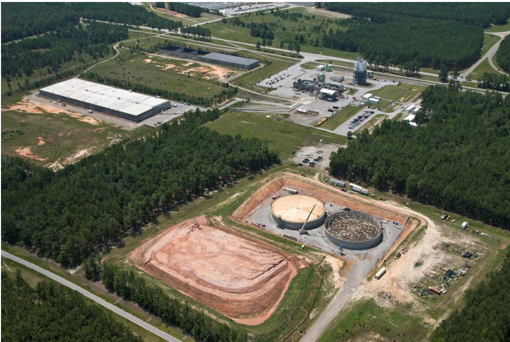
Figure 1: Engineered Cementitious Barriers at SRS

Cementitious barriers are employed to achieve long-term performance for waste disposal units especially in areas of moderate to high rainfall and shallow to moderate ground water tables (Figure 1). Cementitious barriers are also employed in nuclear processing and nuclear energy facilities where current issues are service life extension of existing facilities and performance-based design for future facilities. The National Academies identified a high priority gap as developing improved understanding of the long-term ability of cementitious materials to isolate wastes. Savannah River Site legacy waste operations and closure projects, Hanford Tank Farm closure projects, Saltstone Disposal Facility, Idaho clean-up projects, Oak Ridge remediation and decommissioning, and the West Valley Demonstration Project are examples of potential end users for technology developed by the CBP.