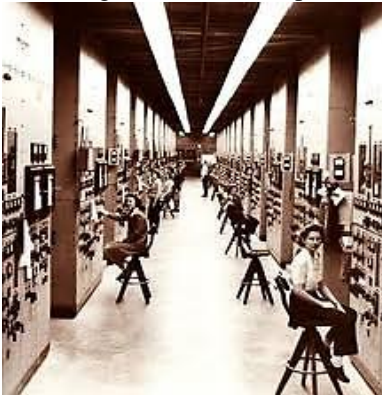
Fig. 3. Women ran the Calutrons.

While the gaseous-diffusion process for enriching uranium led the electromagnetic technology in early 1943,