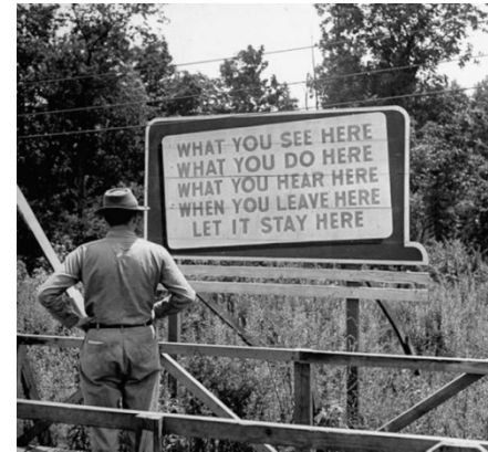
Fig. 2. Secrecy was important.