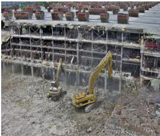
Fig. 4. The massive ½-mile long west wing of the K-25 Gaseous Diffusion Building is being demolished.

The non-mission-essential facility decontamination and demolition and environmental cleanup of the Oak Ridge Reservation is as noteworthy a part of the Oak Ridge story as the days of Clinton Engineer Works. Thus, for the public to fully appreciate the Oak Ridge story, they must learn about the Reservation’s rich history, recognize its global impact, and understand the rationale behind DOE’s environmental cleanup mission.. With an annual budget