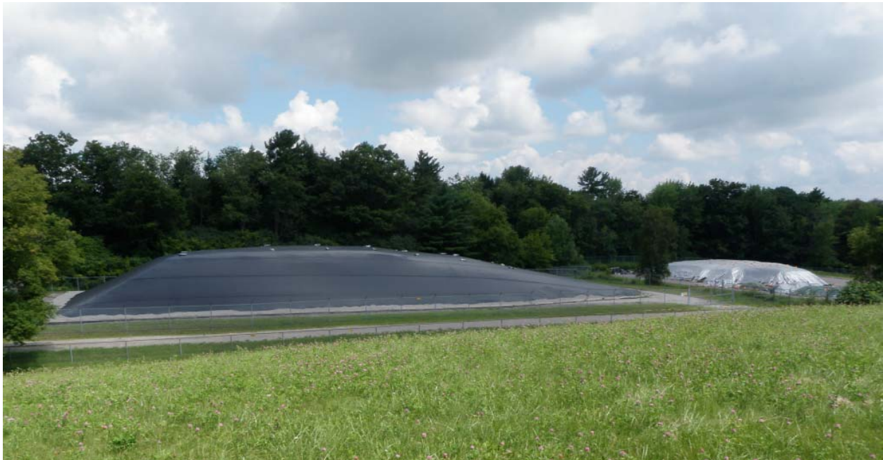
Fig. 1. Port Hope's Pine Street Extension Temporary Storage Site

The temporary storage site consists of two asphalt pads with engineered drainage systems, perimeter security fences, and anchored woven synthetic fabric covers. The original pad, completely secured by a single cover, no longer receives contaminated materials as it has reached its operational capacity. On the receiving pad, multiple covers are used for the different stockpiles on the pads. The main inventory stockpile is secured beneath a large cover and an active receiving stockpile covered by a smaller, more manageable one.