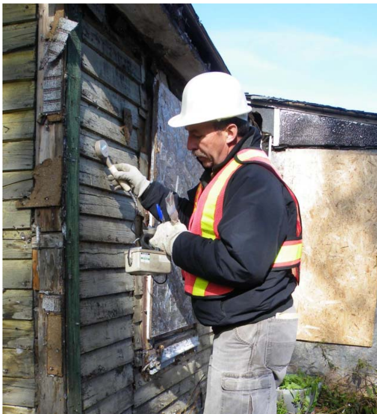
Fig. 2. LLRWMO Staff Surveying Building Materials Prior to the Structure's Demolition