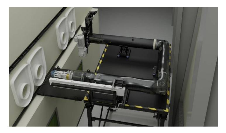
Fig. 3. Rendering of Dounreay PRM before being installed into an existing MSM port.