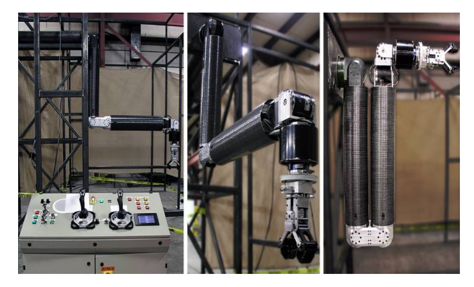
Fig. 1. Powered Remote Manipulator (PRM)

The S.A.Technology Powered Remote Manipulator (PRM) provides a blend of these two approaches by offering a customizable, off-the-shelf, designed solution to its customers.