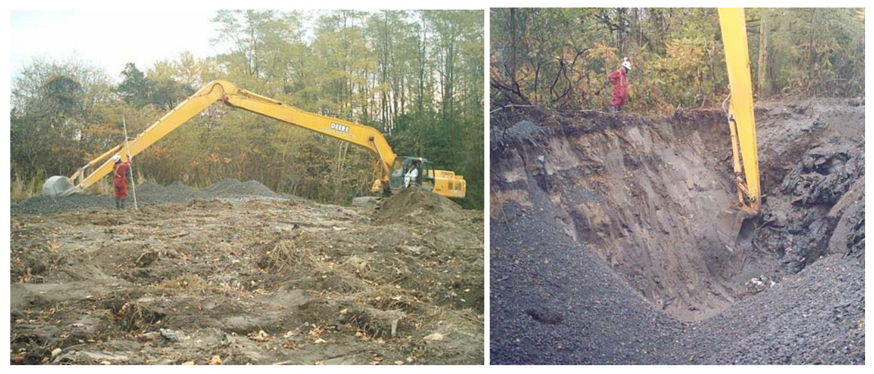
specialized extended boom excavator

In total, approximately 800 \text{m}^3 of buried waste material was removed, consisting of but not limited to filled garbage bags, drums at the upper portion of the trench and calcium fluoride at the lower portion. The excavation was carried out using an extended boom (John Deere Long Reach 330C LC) excavator depicted in Figure 2. This type of excavator provided a reach of approximately 18.3 m. The excavator was positioned at a safe distance away from the north crest of the excavation slope. The native soil wedge between the waste excavation and the erosion scarp was left in place.